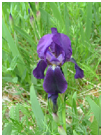
Figure 1: Iris marsica I. Ricci e Colas.

Morphologically, I. marsica is very similar to I. germanica but the latter possesses persistent leaves, stems with 4-6 flowers, spathes which are scarious for 1/3-2/3 of their length, wider flower lacinies, sub-