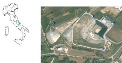
Fig. 1. Study area, water points location

Water samples were selected according their localization in the site: sample 0 is located upward from the landfill, samples 4 and 7 are the boreholes of drainage trench that receive any leachate from the site and sample 5 and 6 are the boreholes of hydraulic barrier that receive any seepage from the drainage trench.