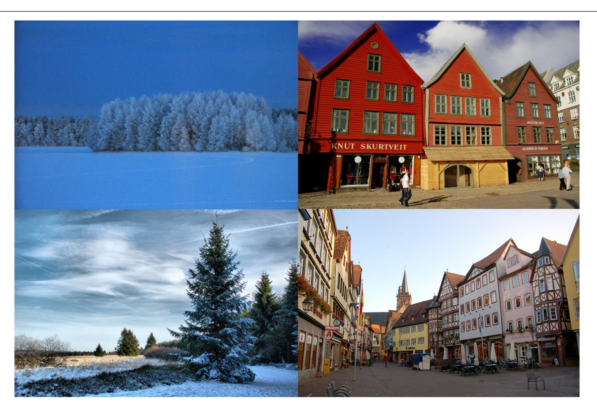
FIGURE 2 | The four Not-Mediterranean images used for the Mediterranean vs. Not-Mediterranean LI-IAT.