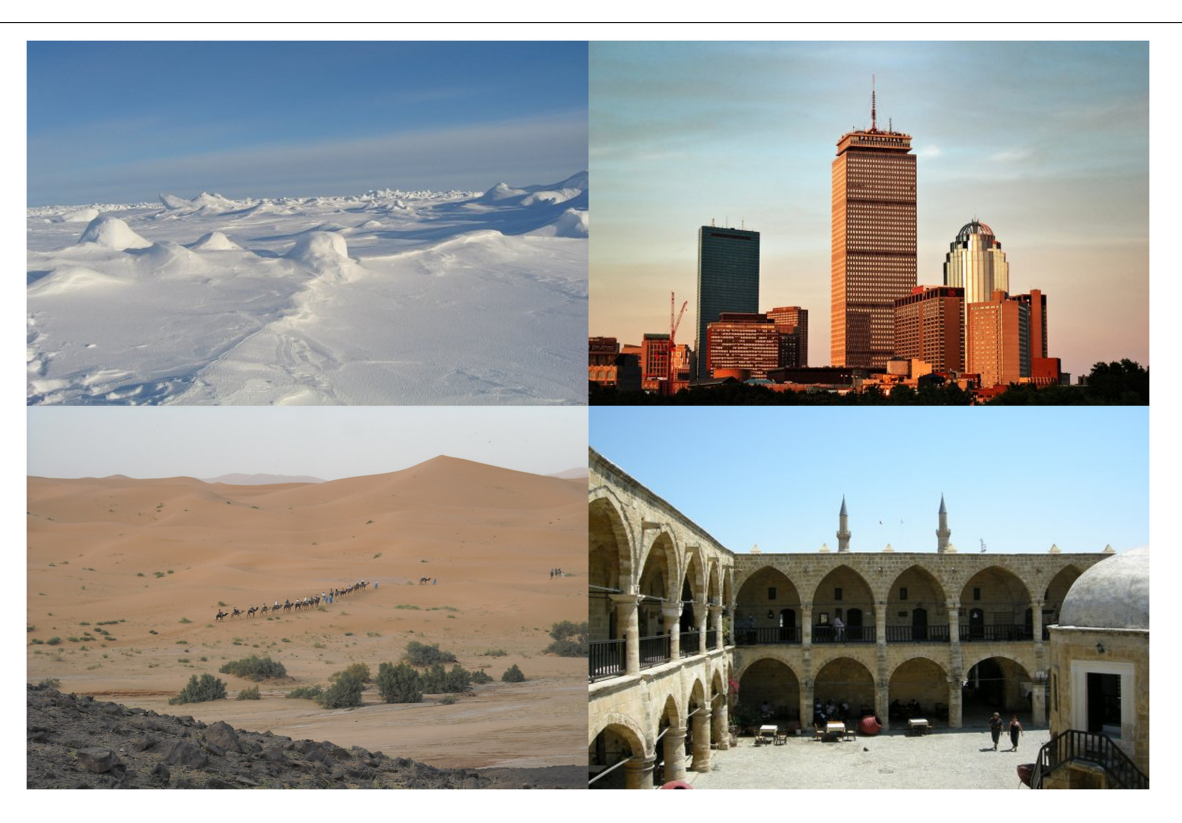
FIGURE 4 | The four Not-European images used for the European vs. Not-European LI-IAT.