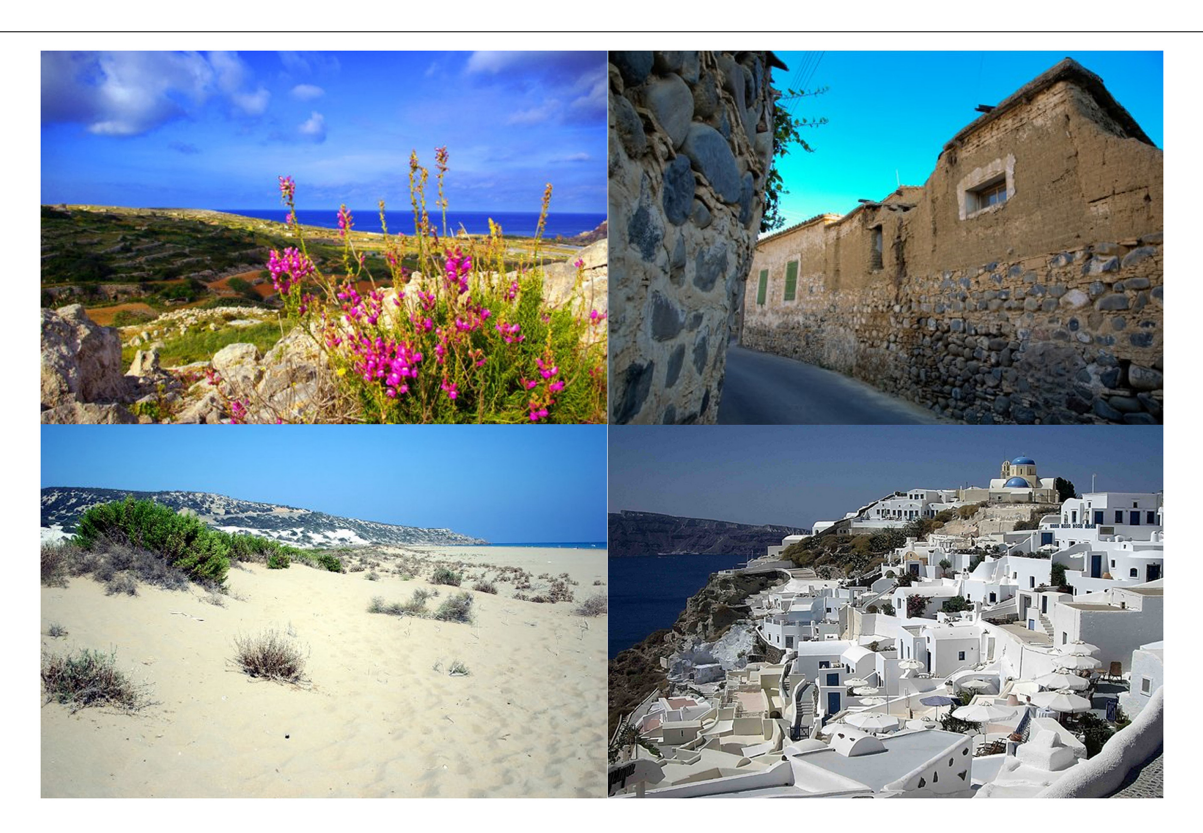
FIGURE 1 | The four Mediterranean images used for the Mediterranean vs. Not-Mediterranean LI-IAT.