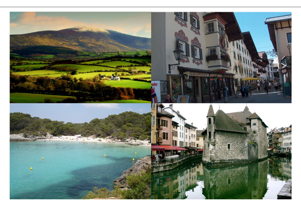
FIGURE 3 | The four European images used for the European vs. Not-European LI-IAT.