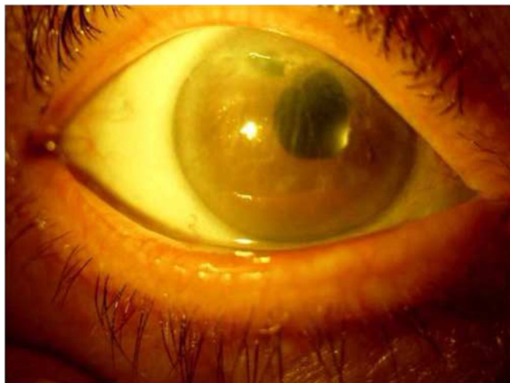
Fig. 2 Slit-lamp biomicroscopy showing the result of repositioning of the dexamethasone implant. Corneal edema

In conclusion, this case report indicates that implant repositioning can be successfully achieved by mobilization and subsequent balanced saline solution injection in the anterior chamber. The procedure is minimally invasive and, due to its celerity, it can have beneficial effects on corneal edema caused by an Ozurdex (dexamethasone) rod in contact with endothelium. However, the disadvantage of this procedure can be the risk for implant migration. Patients must be instructed not only to avoid a prone position or physical effort, but also not to undertake long-distance flights during the first weeks after Ozurdex (dexamethasone) intravitreal implant.