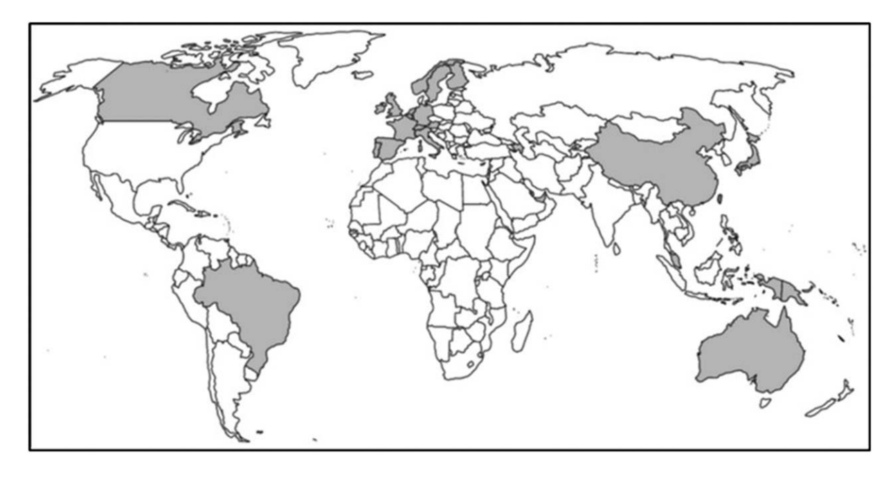
Fig. 3. Current use of universal leukoreduction.

recently showed that, in rabbits, HTLV-2 has a lower infection and replication efficiency in comparison to HTLV-1. Experimental HTLV-1 infection, without disease development, in nonhuman primates was demonstrated in several monkey species inoculated with autologous (1 × 10^{8} )<sup>92,93</sup> or homologous (1 × 10^{7} )<sup>93</sup> infected cells. More recently, development of clinical disease was reported in pig-tailed macaques after inoculation with 5 × 10^{6} to 10 \times 10^{6} mangabey cells infected with an HTLV-1 molecular clone.<sup>94</sup>