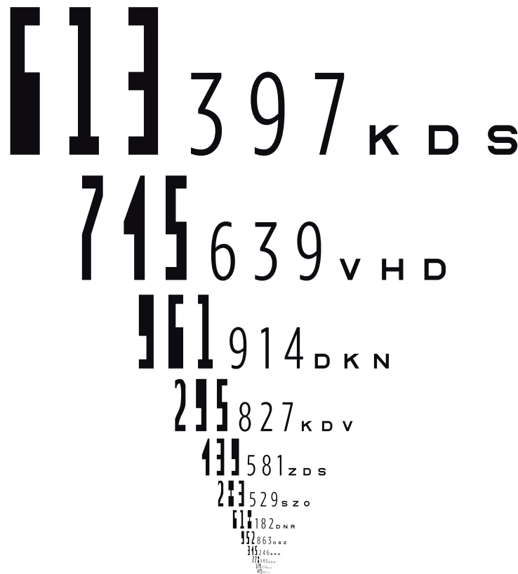
Figure 2. A contest for minimum legible width among three fonts: Pelli, Gotham Condensed Light, and Sloan. On each horizontal line of numbers and letters there are three fonts, and all characters in the line have the same width, though their heights vary greatly. The next line down is always smaller by a factor of 2^{0.5} = 71\% . Thus, going down two lines halves the letter size. The Sloan font, or optotype, is the USA standard for acuity testing. It has a 1:1 aspect ratio. Among the commercially available fonts that we tested, Gotham Condensed Light, with an aspect ratio 2.8:1, has the narrowest legible width. We created several experimental fonts (Arouet and Sticks, not shown) and finally created the “Pelli” font, which has the narrowest legible width. It has a 5:1 aspect ratio. Sloan’s stroke is 1/5 its width; Pelli’s stroke is 1/2 its width. In our sample of normally sighted adults, threshold width is about 0.02 deg for Pelli, 0.04 deg for Gotham (Condensed Light), and 0.05 deg for Sloan. You can use this chart to confirm this for your own eyes. At any viewing distance greater than 2 m, once you reach your limit for Sloan, you’ll be able to read four more lines of the Pelli font.