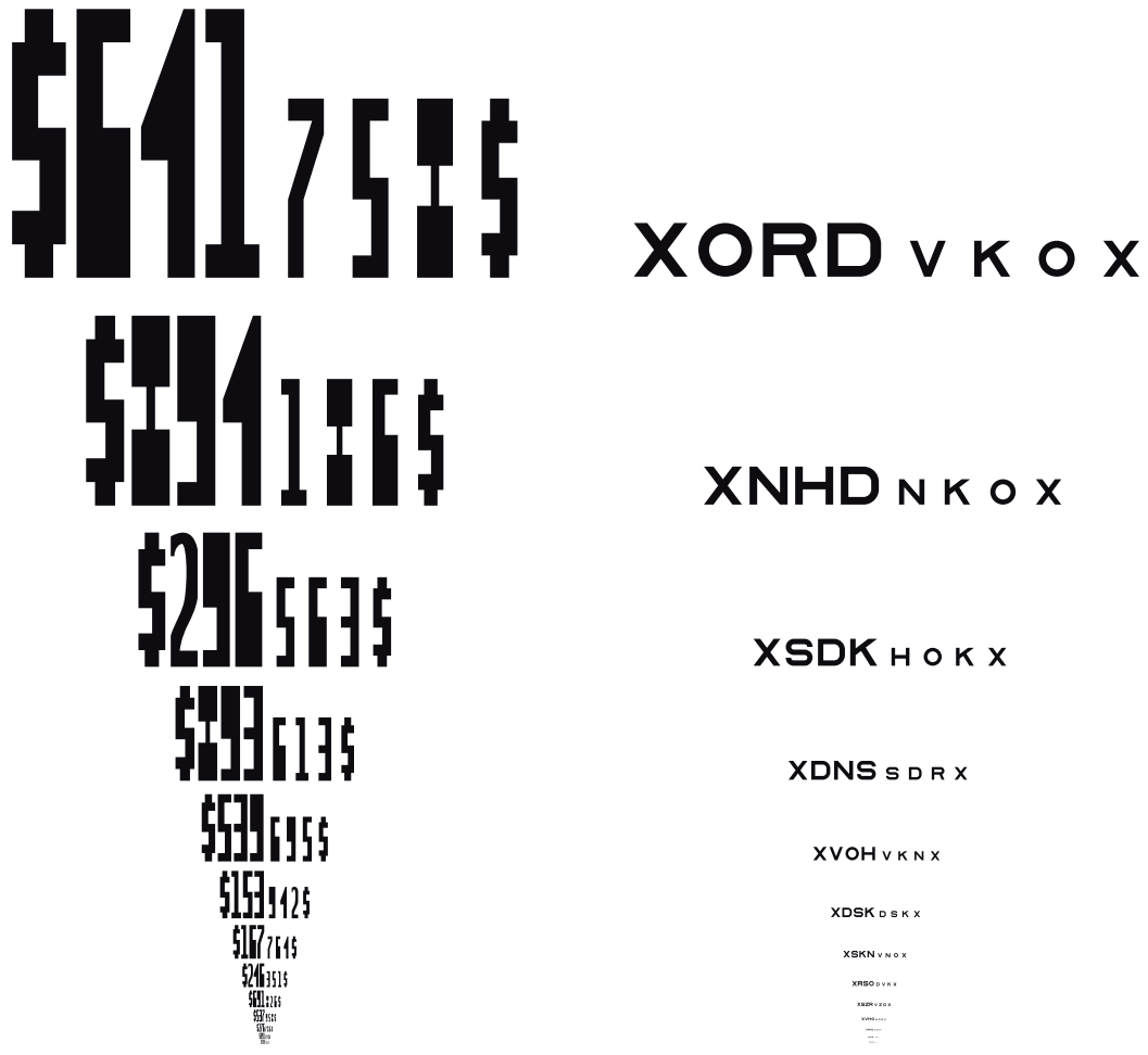
Figure 3. These charts allow you to measure your threshold spacing with two fonts, Pelli (left) and Sloan (right). The center-to-center letter or number spacing is fixed for each row, all the way across both charts. See text for details.

Figure 3 demonstrates the principle. There are two charts, one using the Pelli font, the other using the Sloan font. Each chart has two halves, left and right. These charts measure threshold spacing. Any given row has the same letter or number spacing (center to center), all the way across within each chart and across charts. The two halves of each chart have different character sizes. The ratio of spacing to size is 1.2 on the left and 1.8 on the right, on both charts. When you read down as far as you can go, you might be able to read farther down the left half because it has larger letters. The left-side letters are 1.8/1.2=1.5 times bigger, and the successive rows of the chart are approximately 1.4:1, so, if you are size -limited, you will read one line farther down on the left side. However, if you are spacing -limited, the bigger letters won’t help. This left-right difference is diagnostic. The critical spacing is small, so in order to reach it, letters must be legible at very narrow width. Testing ourselves, we find no left-right difference in our limit of reading on the Pelli chart (left). We do find a one-line difference on the Sloan chart on