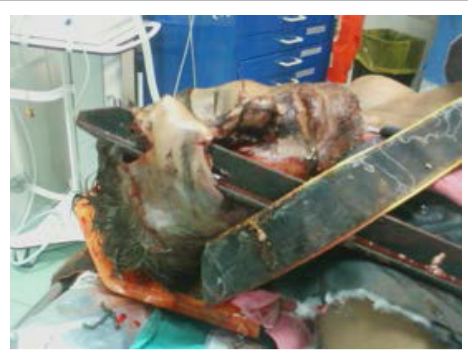
Figure 1: The Patient arrived in ER dept. with the rod passing through frontal area entering in the superior eyelid pushing the eye globe.