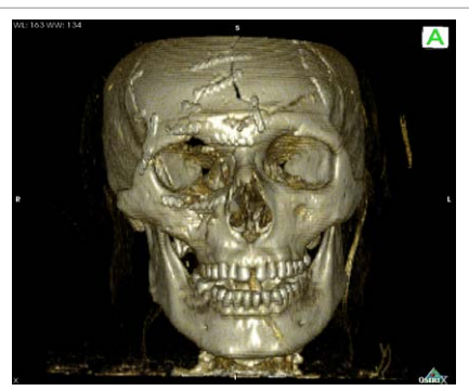
Figure 3: A 3D CT reconstruction in submental view showing the frontal fracture.

and the superior longitudinal sinus was clipped without difficulty. A large-scale duroplasty was performed with a bovine pericardial patch. Fibrin sealant was applied over the repair. The mucosa was removed from the frontal sinus walls as well as from the nasofrontal ducts. The pericranial flap is adapted in order to fit the anterior cranial fossa. The frontal volet was than replaced and secured with plates and screws. It's imperative to relieve any sharp bony edges off the anterior aspect of the bone flap to prevent injury to the vascular pedicle of the pericranial flap. After cranialization, the nasofrontal ducts was obliterated with a piece of temporalis fascia, fibrin glue is applied over the ducts, and the pericranial flap is designed appropriately and folded in order to obliterate the dead space of the sinus. The anterior wall was replaced and secured using plates and screws. All bony impingements on the vascular supply of the flap must be relieved. The bi-temporal flap was then closed in a layered fashion and a pressure dressing is applied and maintained for 48 h [2,3].