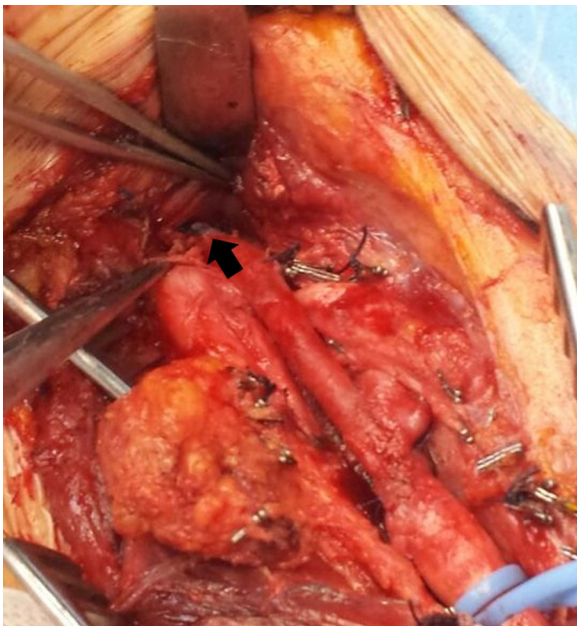
Fig. 2. Intraoperative picture showing repair of the internal carotid artery (ICA) with a small saphenous vein patch (arrow).