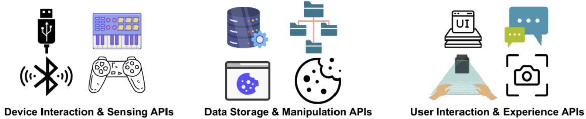
FIGURE 1. Types of Modern Browser APIs

tions can then utilize this data for services like maps, local search results, or location-aware gaming.