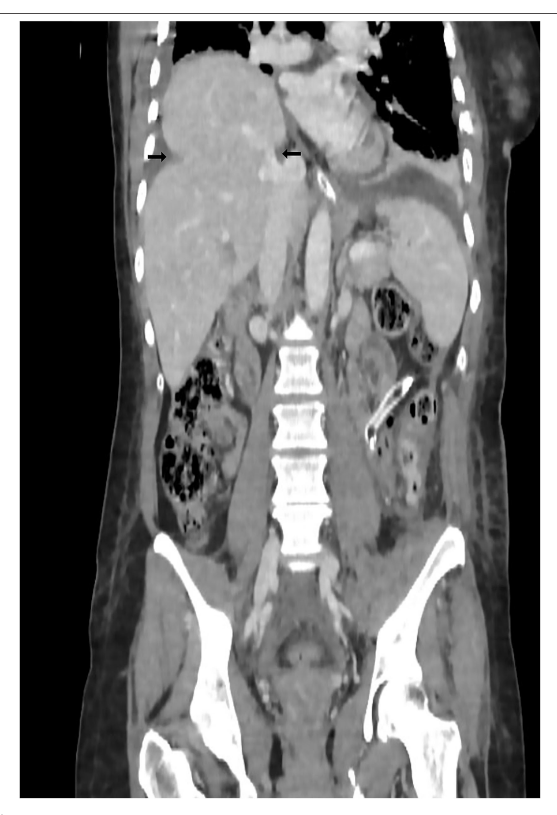
FIGURE 2 | Fourth postoperative day Thorax-Abdomen contrast-enhanced CT that showed the raising of the right liver dome and collar sign (black arrows) with herniation of the VII and VIII liver segments.