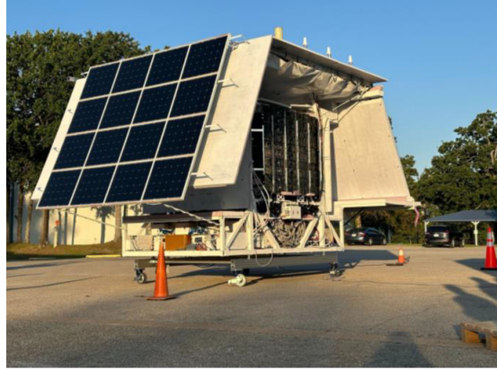
Fig. 1. – Fully integrated GAPS payload taken in June 2024 (Palestine, TX, US).

they will be captured by a silicon atom to form an exotic excited one. This will de-excite, emitting characteristic X-rays, whose energies are different for different antiparticles. After this process, when the antiparticle is in the proximity of a nucleus of silicon or lithium atoms, annihilation occurs, forming a hadron star (mainly secondary pions and protons). Since the mean number of such secondaries is approximately proportional to the number of antinucleons, their multiplicity provides an additional discriminant to identify the impinging antiparticle. This process is illustrated—in a schematic way—in fig. 2, for both an antiproton (left) and an antideuteron (right).