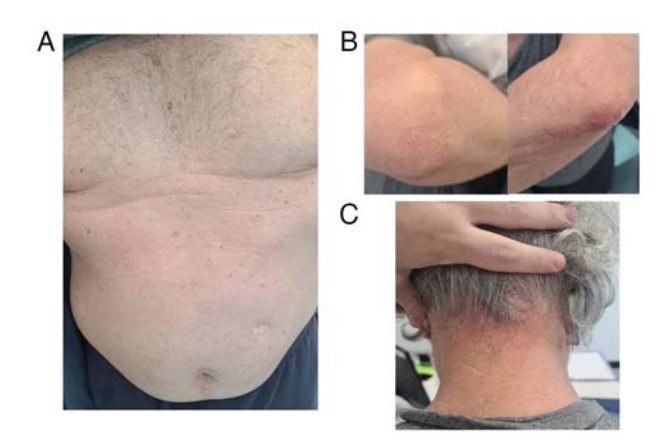
Figure 4. (A) Abdomen without psoriasis. (B) Improvement of elbows' psoriasis. (C) Improvement of scalp's psoriasis.

The treatment can be continued. For G3 (rash covers >30% BSA or grade 2 with substantial symptoms) withhold ICIs, topical treatments as above (potent) and steroids. If mild to moderate 0.5/1 mg/kg prednisolone once daily for three