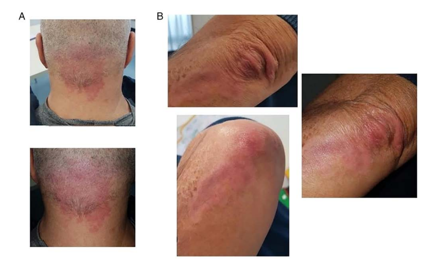
Figure 1. (A) Psoriasis of the scalp; (B) psoriasis of the left elbow.