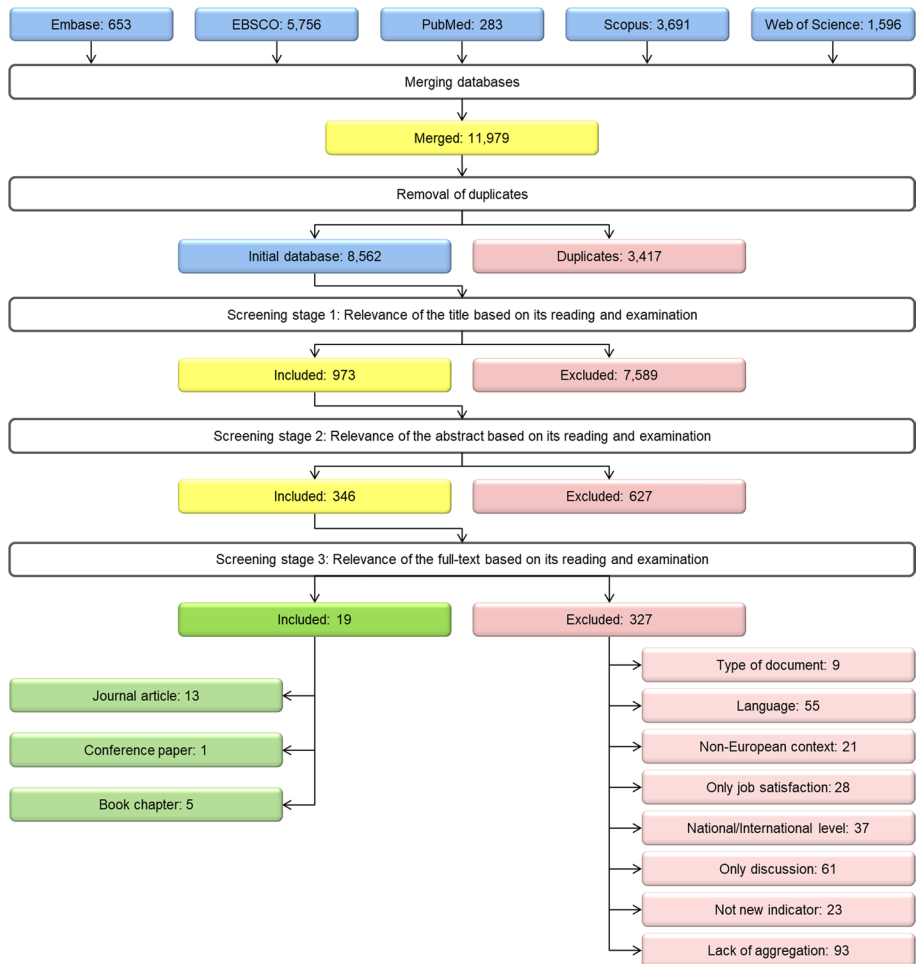
Fig. 2 Flowchart of the systematic review

2 papers. The most recent papers (i.e. Arranz et al., 2018; Warren & Lyonette, 2018) are published in these two journals.