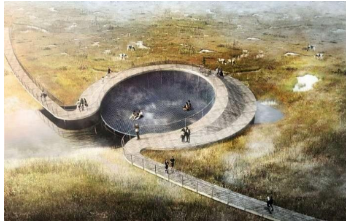
Figure 3. Raised walkways that cross the wetlands. Original picture by C.F. Møller Architects, graphically modified for editorial purposes.