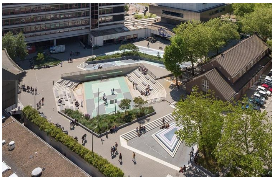
Figure 2. Aerial view Waterplain in Bentheimplein . Original picture by Ossip van Duivenbode for De Urbanisten, graphically modified for editorial purposes.

The project is characterised by an integrated, defensive, and adaptive approach, and its main goal is achieved thanks to the construction of rainwater catchment basins that in favourable weather conditions can be used as recreational spaces (Figure 2), the integration of gutters that convey water from building roofs into the basins, and the construction of stormwater drainage channels that in favourable weather conditions can be used as recreational spaces, such as skateboard tracks [47].