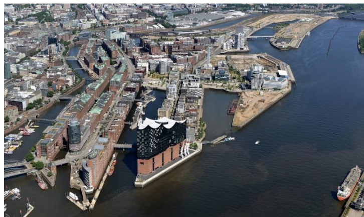
Figure 5. The artificial dunes of Hamburg's floating city. Original picture by Kcap, graphically modified for editorial purposes.

The project is characterised by an integrated, defensive, and adaptive approach, and its primary goal is to protect the built-up area near the coast; it pursues this objective through the construction of artificial hills to raise buildings approximately 8/8.5 m above sea level (Figure 5) [50].