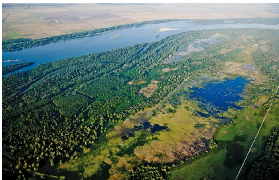
Figure 1. Aerial view of the Danube.

The project is characterised by an integrated, adaptive approach aimed at the de-anthropisation of the area, with the goals of restoring the floodplains (Figure 1) and preserving currently unprotected areas to foster biodiversity; it pursues these goals through the removal of existing embankments to encourage natural flooding, the removal of weed species, and the planting of native trees to encourage the natural regeneration of the forest [46].