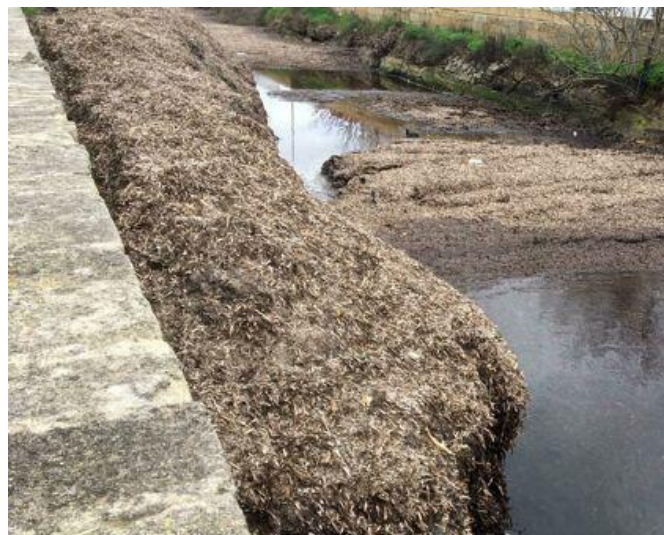
Figure 4. Posidonia Oceanica leaves which obstruct the drains. Original picture by LeccePrima graphically modified for editorial purposes.

The project is characterised by an integrated, defensive, and adaptive approach. Its primary goal is to mitigate the effects of coastal erosion; the nature-based solution to achieve this goal is the remodelling of the dunes through the circular integration of natural waste collected along the shoreline, that is Poseidonia oceanica leaves washed up in the mouths of the drainage channels (Figure 4) [49].