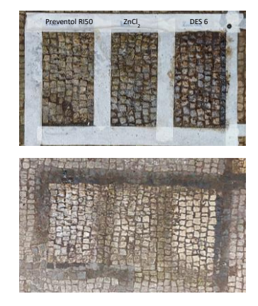
Fig. 2. Application of DES 6 (above) and after application (below) in area of the mosaic in the Archeological Park of Ostia Antica (Rome).

The zinc chloride component is known for its biocidal property, but DES containing zinc chloride also show similar biocidal effects. In fact, the application of DES 6 resulted in having an effective cleaning action.