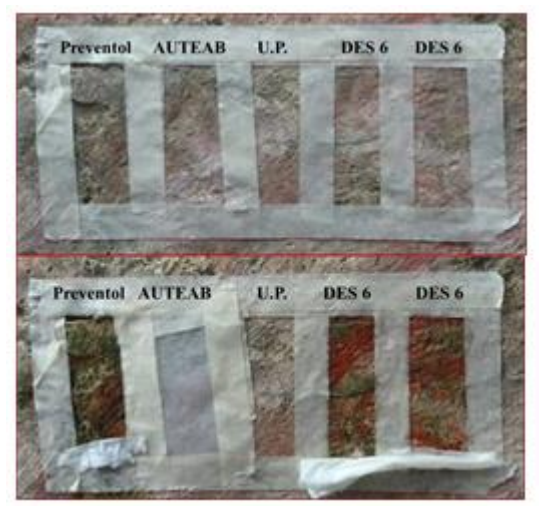
Fig. 3. Before application of DES 6 (above) and after application (below) during conservative treatment of wall painting in Motta San Giovanni (Reggio Calabria).

Additionally, DES 6 was also tested during the conservative treatment of the ruins of a wall painting known as "Déesis" of Motta San Giovanni (Reggio Calabria). It was tested on a portion of the pictorial film affected by the presence of a biological patina, as reported in Fig. 3.