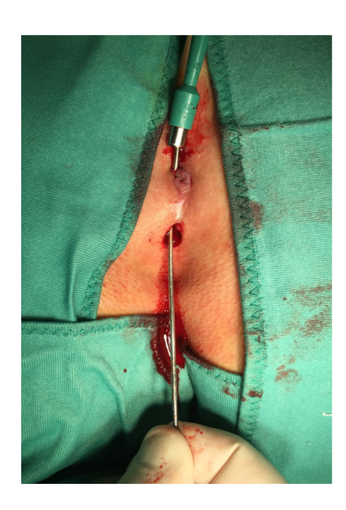
FIGURE 1 Coring out is performed by the biopsy punch, under guidance of the surgical probe