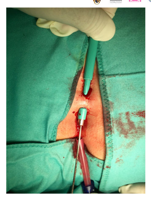
FIGURE 2 Coring out by the punch biopsy is completed