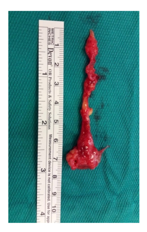
FIGURE 3 The removed specimen includes pilonidal cyst and fistula

wound by means of a size 15 mm scalpel, removing only the necessary diseased tissue. If the PD does not present any lateral involvement but only midline pits, these are first treated and removed by means of biopsy punches of the smallest size to achieve removal, and the resulting small central wounds are sutured, again with loosely applied Vicryl<sup>®</sup> Rapide 3/0 or 2/0 (Ethicon). Large calibre (e.g., 8 or