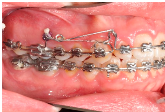
Figure 10. Canine and incisor distalization strategy.