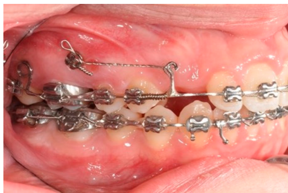
Figure 7. Molar and premolar distalization strategy: Power chain from the first molar (blocked with a metallic ligature with the second molar) to the second bicuspid and coil spring between the solder and the first bicuspid allow for the simultaneous distalization of the second and first bicuspids.

Once the upper first molars reach the hyper-first-class position, the tads are repositioned exactly mesial to the first molar. The solder distal to the bicuspid is removed and a new one is made distal to the ideal cuspid position. A power chain from the first molar (blocked with a metallic ligature with the second molar) to the second bicuspid and a coil spring between the solder and the first bicuspid allow for the simultaneous distalization of the second and first bicuspids (Figure 7).