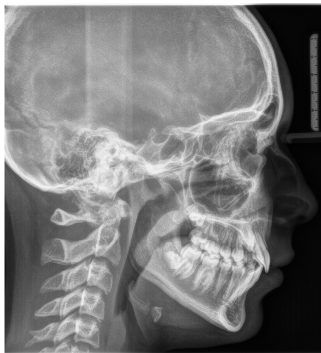
Figure 3. Initial lateral cephalogram.