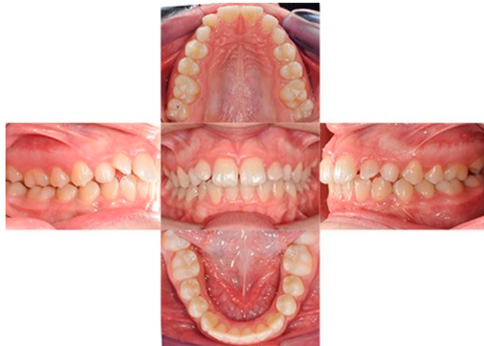
Figure 1. Initial intraoral photos.