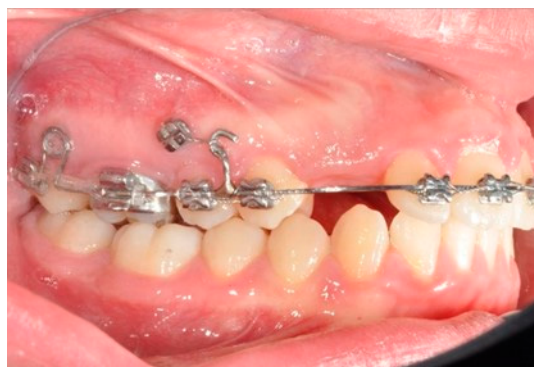
Figure 4. Molar and premolar distalization strategy.

The helical bulbous loop produces space distally to the upper first molars. An open coil is added between the second bicuspid and the first molar in order to move to the distal second and first molar at the same time (Figures 4 and 5). Eventually, an elastic module is placed between the hooks on the second molars and the first molars in order to finish the combined distalization of the upper first molars.