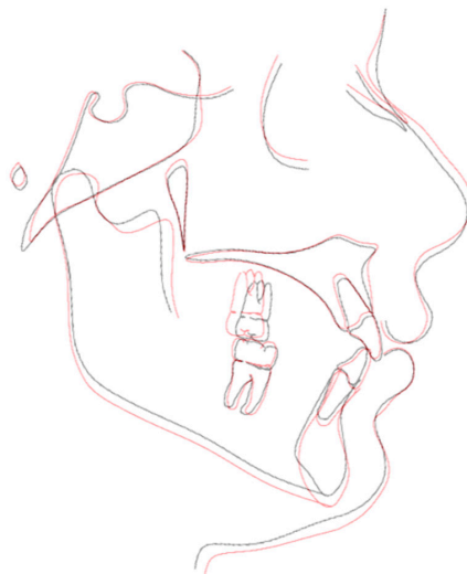
Figure 13. Superimposition.