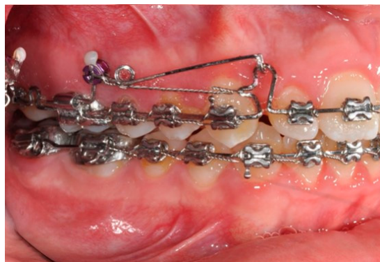
Figure 9. Canine and incisor distalization strategy: The cantilevers produce intrusion of the incisors and torque control during retraction.

In this case, right after the spontaneous eruption, a power chain from the right tad was used to derotate and distalize the right upper canine (Figure 8). On the upper arch, a 0.20 \times 0.25 SS wire was prepared with modified “cactus-shaped” closing loops, with the aim to close the space between the canines and the laterals. The cactus loop has a double aim. First of all, it is used as a closing loop; activation is produced by tying the loop through a metallic ligature from the tads. Secondly, it serves as a hook for cantilevers. The cantilevers are made using 0.19 \times 0.25 TMA. The retraction of the upper incisors is supported by two cantilevers applied distally on the tads. The cantilevers will support the mechanics in order to produce intrusion of the incisors and torque control during retraction [1] (Figures 9 and 10).