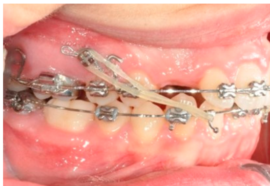
Figure 6. Molar and premolar distalization strategy: Hooks are placed between the laterals and the cuspids. Third-class elastics (1/4" 6 Oz) are placed from the tads to the hooks.

between the laterals and cuspids. Third-class elastics (1/4" 6 Oz) are placed from the tads to the hooks (Figure 6). The distal tip on the lower second molars will produce a gain of space between molars, with the space needed for the management of the spee curve and the recovery of IMPA.