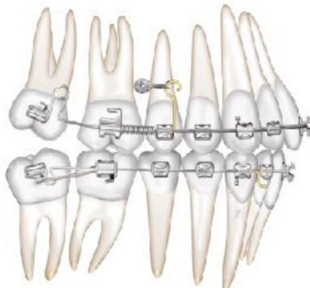
Figure 5. The first molars are distalized by using a simple open coil spring.

After tad positioning, sequential bonding is applied on the lower arch. An 18 \times 0.25 SS arch is shaped, adding a maximum 10^\circ distal tip to the second molar. Hooks are placed