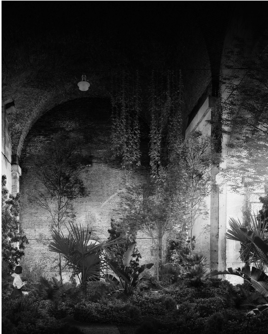
Concept design. Render. Drawing by the authors, 2023.