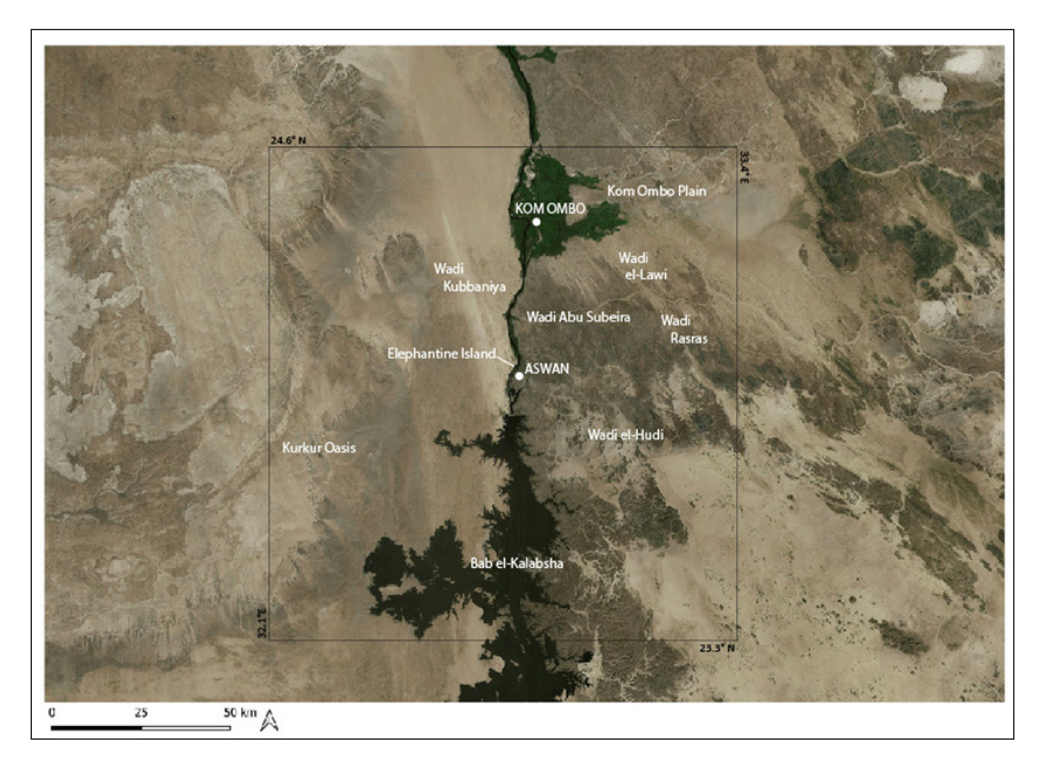
Figure 1 Map of The BORDERSCAPE Project study area.