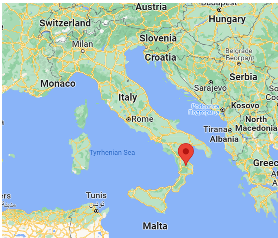
FIGURE 4 Geographic position of Longobucco, from google maps http://maps.google.com (Accessed 6 August 2022).

Subsequently, he probably moved to Verona and likely died there around 1286 (24).