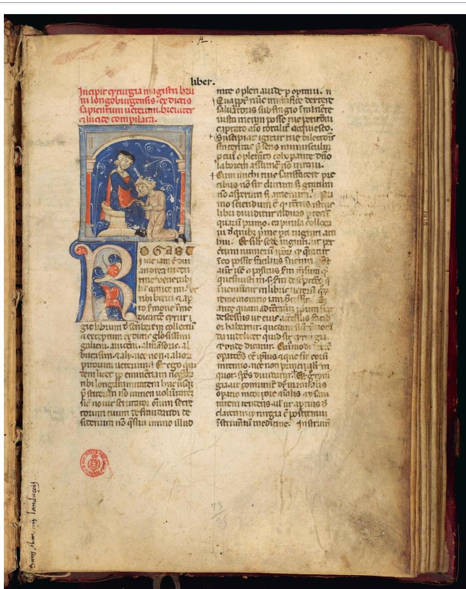
FIGURE 5 The first page of Chirurgia Magna (“ Chirurgia magistri Brunii ”) in a manuscript of the 14th century