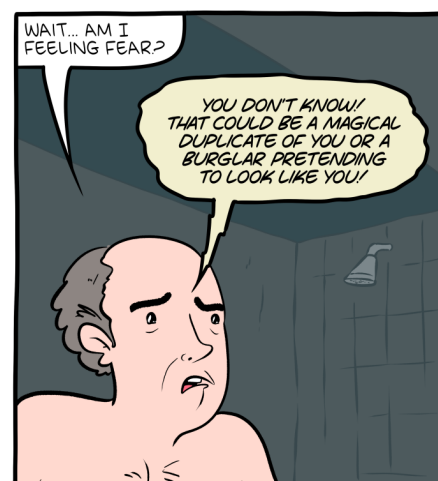
The Human Brain: Can do calculus, but is also reserving judgment about whether the guy in the mirror is a ghost.

ASSISTANT PROFESSOR: in Philosophy of Science, London School of Economics, deadline 12 December.