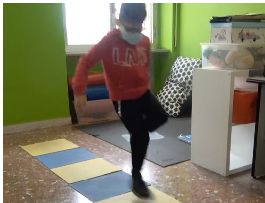
VIDEO. 1. The patient at the age of 7 years while walking, running, standing, and jumping on one foot. [Color figure can be viewed at wileyonlinelibrary.com ] Video content can be viewed at https://onlinelibrary.wiley.com/doi/10.1002/mds.29585

We report on an 8-year-old boy with subtle neurological signs, including generalized tonic-clonic seizures during fever, mild language impairment, dystonic postures of lower limbs during walking, and occasional tongue dyskinetic movements (see Data S1 for more details and Video 1). A next generation sequencing-based epilepsy panel revealed a de novo NM_020988.3:c.163_164del variant in GNAO1 . No additional candidate variants were identified. Reverse transcription polymerase chain reaction showed an approximately 50% decrease in the expression of the endogenous GNAO1 gene in cells from the affected child compared with cells from the unaffected father (Figs. 1A and S2), suggesting nonsense-mediated mRNA decay (NMD). If translated, the c.163_164delAT allele was predicted to generate a truncated protein (p.Ile55Hisfs*3). As expected, Western blotting performed in transiently transfected HEK293T cells revealed the lack of the truncated form of G \alpha (Fig. 1B), which was not restored by MG132 or