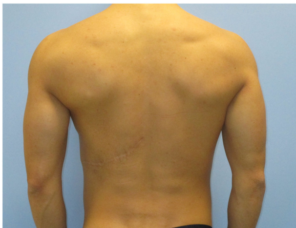
Figure 4. Post-operative result at 18-month follow-up in the posterior projection.

achieved, surgeons should favour the least complex and shortest possible alternative in the ladder of surgical options.