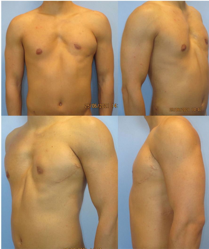
Figure 3. Post-operative result at 18-month follow-up, in the frontal (upper left), right oblique (upper right), left oblique (lower left), and lateral (lower right).

stiches for superficial subdermal plane and 3-0 absorbable antibiotic-laced multifilament threads for running intradermal sutures. A vacuum drain is left in place at the very lateral end of the wound.