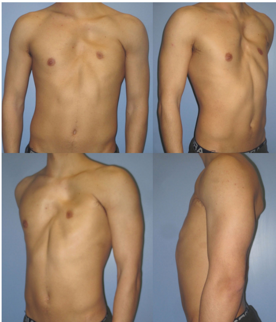
Figure 1. Pre-operative photographs of the 23-year-old patient, in the frontal (upper left), right oblique (upper right), left oblique (lower left) and lateral (lower right) projections.

clinical examination. A chest Magnetic Resonance Imaging (MRI) scan was performed prior to surgery, showing agenesis of the left PM muscle belly, hypoplasia of the left mammary gland and a depression of the second, third, fourth and fifth chondro-costal junctions [11].