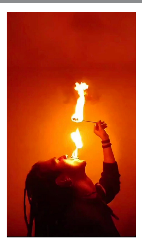
Figure 2 Fire eater in action.

added to therapy. As a result, clinical stability was achieved in the next days.