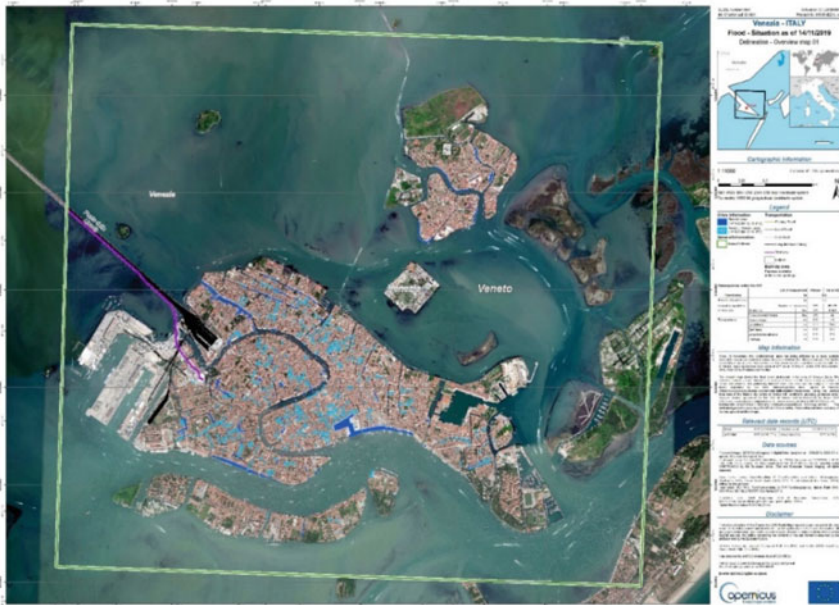
Fig. 53.5 High-resolution image of the flooding that occurred in Venice on 19th November 2019. The different levels of high tide flooding were scanned in real time by altimetry sensors. The restitution of the image represents the flooding with different

(DT) for built environment. Urban DT is designed as three-dimensional databases that are continuously fed with real time data representing both the building components as well as their qualities and other useful information, with the aim of giving a complete picture of the state-of-the-art and in the meantime simulating activities and management of processes of operation (Weekes 2019). The concept of DT implemented at the scale of urban environments is leading to the concept of City Digital Twin (CDT), a virtual model that takes the analysis from the single building (or even single housing unit) to a higher and more complex level, requiring the highest level of interdisciplinary integration to be jointly defined in the near future.