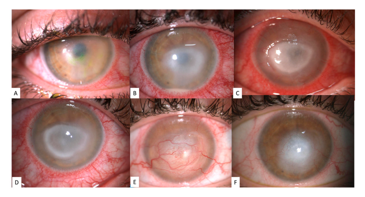
Figure 1. Representative images of the clinical evolution of Acanthamoeba keratitis (AK): early phase AK showing epithelial keratopathy ( A , stage I) [3], stromal involvement and sterile hypopyon ( B , stage II) [15], epithelial defect and ring stromal infiltrate ( C , D , stage III) [11], and corneal scarring with deep and superficial neovascularization ( E , F ).

The diagnosis of AK originates from the patient's history, patient's presentation, and clinical suspicion. Symptoms frequently seen in AK include severe ocular pain, associated tearing, redness, photophobia, and decreased vision [1,3,4,6,7,11,12,19–21]. Generally, patients will have a unilateral presentation, but in up to 7.5% of cases, the presentation may be bilateral (Figure 1) [7,11]. Early clinical signs of infection include limbitis (95% of cases), perineural infiltrates (57% of cases), and punctate keratitis (46% of cases), as well as less common clinical signs, such as pseudodendrites and epithelial or subepithelial infiltrates; after two months, the collection of common clinical signs continues to include limbitis (96% of cases), as well as a ring infiltrate (or "Wessely immune ring," 83% of cases), epithelial defects (75% of cases), and uveitis (79% of cases) [3,6,11,15,21,22].