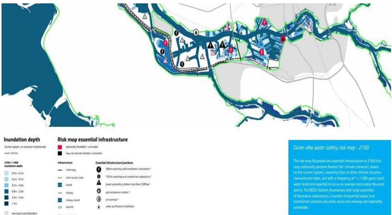
Figure 2. Settings at flood risk, forecast at 2100, indicating the infrastructure at risk.