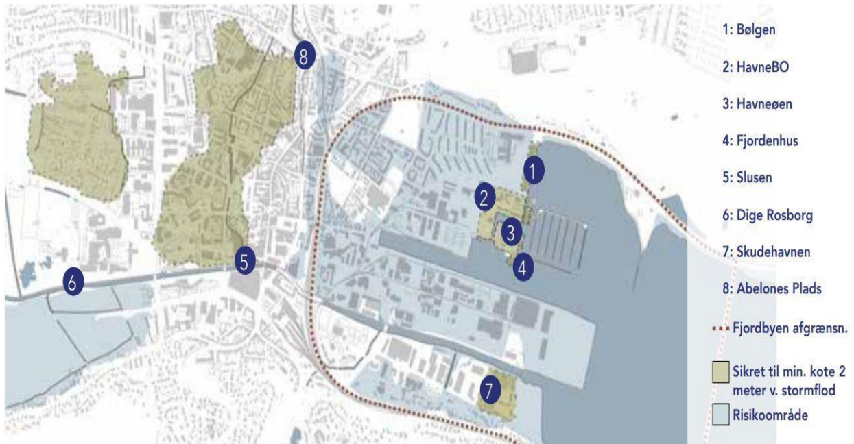
Figure 1. Settings at flood risk starting from 2030; areas above 2 metres in elevation are in yellow.

The Rotterdam Climate Change Adaptation Strategy (2013) identifies four general strategies for the city’s adaptation to the flooding phenomenon: