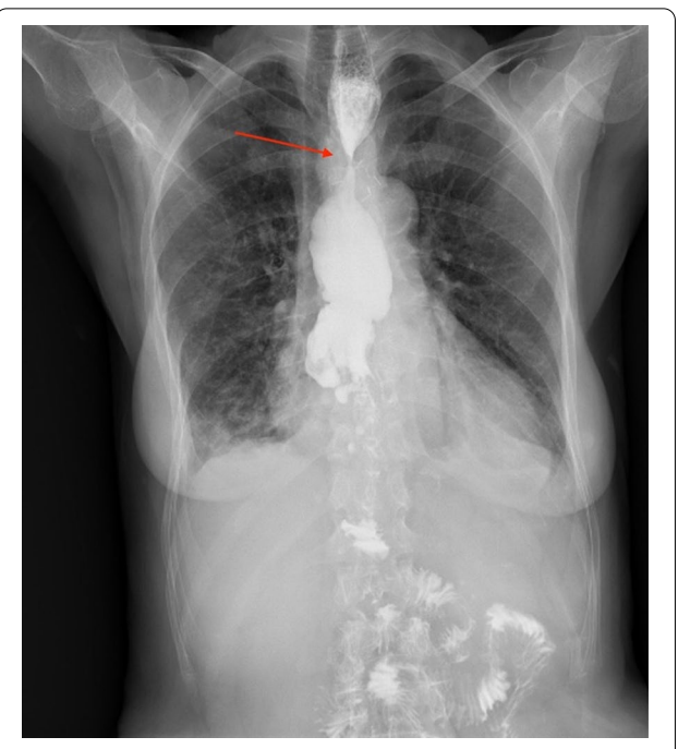
Fig. 1 Preoperative barium swallow test shows severe esophago-colonic anastomosis stricture (red arrow) with proximal esophageal dilatation

Re-median sternotomy was cautiously performed. The anastomotic tract appeared completely encased by fibrocalcific tissue probably due to chronic inflammation