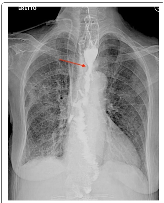
Fig. 4 Postoperative barium swallow test points out a significant improvement in conduit caliber. Red arrow shows where re-anastomosis was performed

re-approximate sternal margins considering the stability and rigidity of the anterior chest wall due to the fibrocalcific tissue in the anterior mediastinum. In fact, in this case sternal closure would have caused significant compression on the conduit because of the extensive fibrosis and calcification of the mediastinum immediately under it. However, intestinal conduit requires protection. In this case, the high risk of anastomotic complications and infection bring us to avoid the use of prosthetic material. Pedicled muscle flap coverage with native pectoralis major muscles was used.