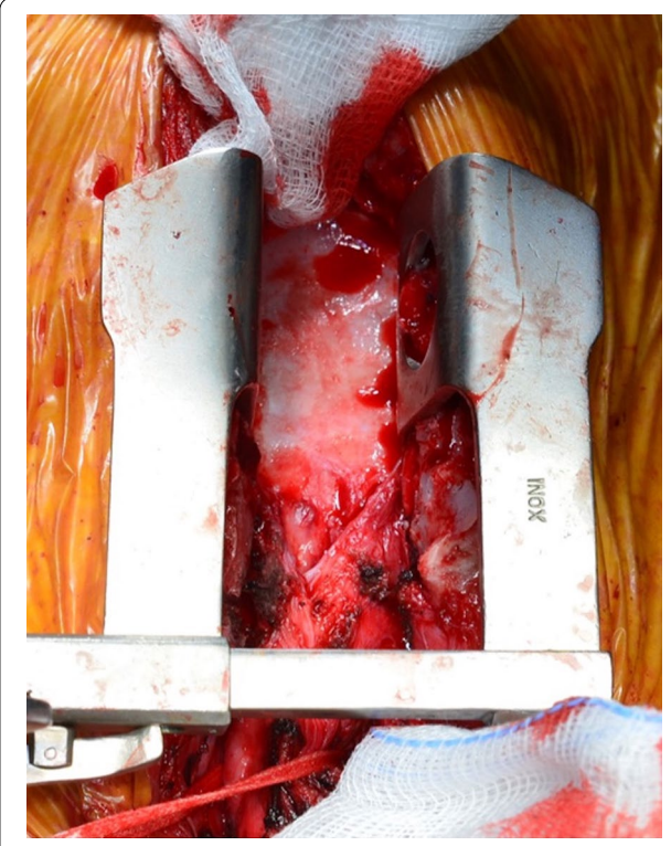
Fig. 2 Intraoperative view. Fibrocalcific tissue takes up the whole anterior mediastinum after sternal opening