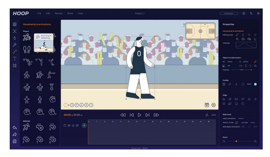
Figure 5. Students' project. HOOP is a platform designed for coaches and referees to help them represent play patterns, training and tactics.