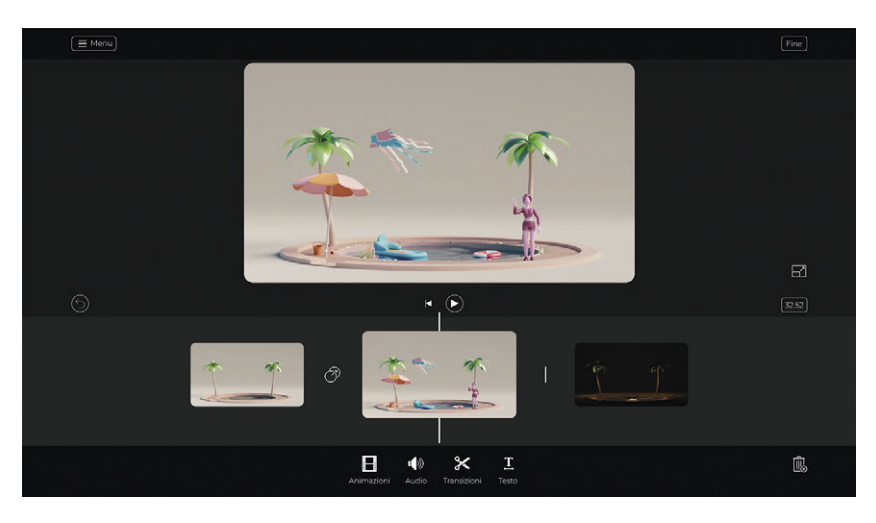
Figure 4. Students' project. ANIVERSE is a generalist platform: its peculiarity is that backgrounds, tools and characters are modeled in a three-dimensional environment.

three-dimensional environment (Figure 4). The platform has a structured design process with few margins of variation marked in two stages of production and preproduction and programmatically defines the consultation of the library and selection of the items. This type of platform, innovative in the use of depth, has imposed a reasoning in relation to some difficulties related to the compositing<sup>5</sup> of the various elements. To overcome some difficulties, some interesting design choices were made such as creating the background environments on circular bases: this was a winning choice both on the aesthetic side as it is very captivating, and on the functional one, since simply rotating 360 it has a first simple but pleasant animation.