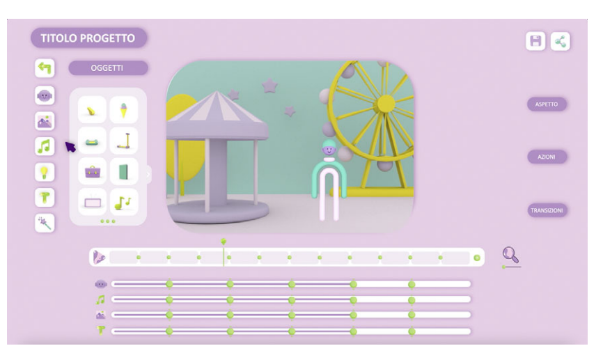
Figure 3. Students' project. PSY JELLY is a thematic platform on the topic of autism designed for children and psychoterapists.

of denunciation, indoctrination or education in a perspective of social validity and integration, as anticipated, has given rise to some very interesting results. One of the groups chose the theme of autism in children and designed a kid friendly platform, PSY JELLY (Figure 3), to be used by psychotherapists to produce animated videos to support therapeutic paths for children with autism or Asperger's, but above all by children both from a playful and didactic point of view to easily learn some behaviors. In addition to the study necessary to set up the work consistently, the interesting effort was to choose a graphic design designed for autistic children with certain shapes and colors as well as a simple and understandable interface even for the smaller ones. Pastel colors with a specific level of saturation, absence of anatomical details, use of easily recognizable geometric shapes and a library of actions set in carefully prepared contexts with a limited margin for customization.