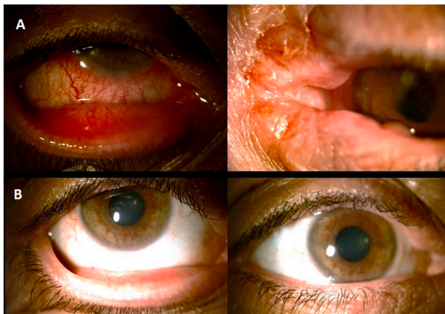
Fig. 1. A: bilateral eczematoid blepharitis with scattered ulcers, caruncular edema, lacrimal punctum swelling, severe conjunctival injection. 1 B: substantial regression of the conjunctivitis, dramatic improvement of the erythema, lichenification and periocular skin ulcers.

Even in this case, the pimecrolimus 10 mg/g cream topically to the eyelid twice a day until clinical remission was administered. The patient missed the 7-day follow-up visit and was reassessed 3 days after. Physical examination showed complete clinical remission and the therapy was continued at the frequency of two applications daily for the first 10