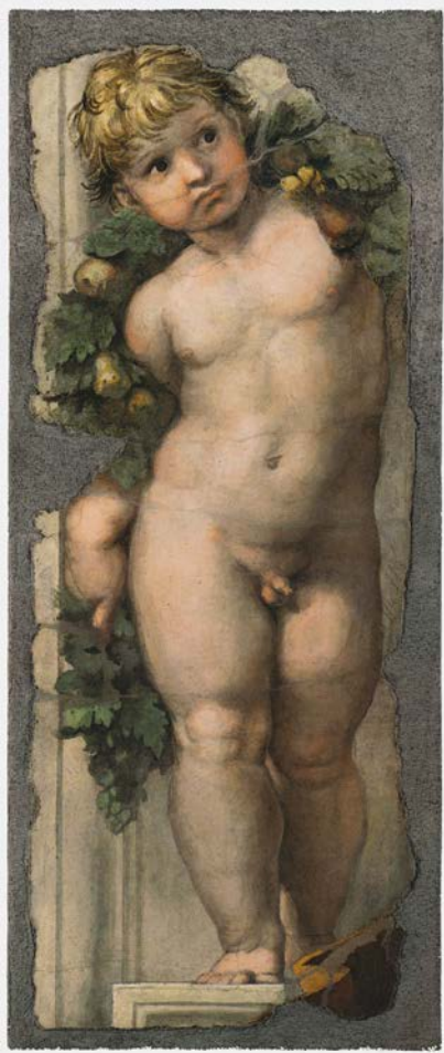
Fig. 1. Raffaello Sanzio, Putto carrying a festoon , 1513, fresco. Rome, Accademia Nazionale di San Luca.

and since then carefully and sometimes critically scrutinised (fig. 1). Instead another factor, that was anything but secondary, played a key role in the successful outcome of the study, i.e., the involvement of a very broad-minded sponsor who made it possible to exploit the incredible potential of innovative ideas, tools, and technologies [1].