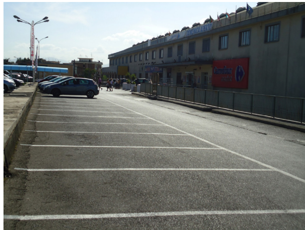
Figures 8–11: The second stretch of Via Plinio with the view of the ruins and the wide space close to the market.