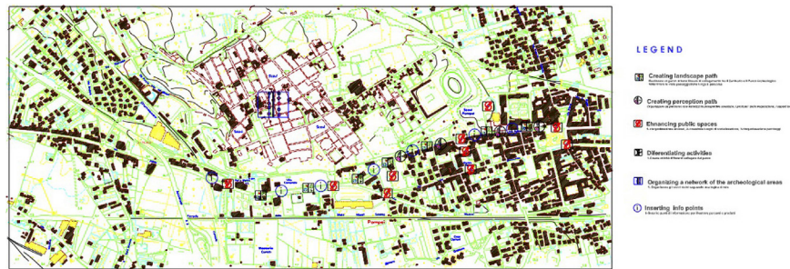
Figure 20: Pompeii. Complex map of design.

These paths should be equipped with sensors and information points which should inform about the history and culture of these places. An archaeological festival should be held periodically to draw people to experience the three areas.