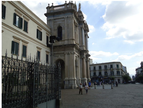
Figures 16–19: Via Roma, the last stretch of the path and the Pompeii Sanctuary.

In the fifth phase, involving assembly of the collected information, the recorded data represent the basis for the construction of the graphical system of symbols and the related multimedia schedule. By suitably overlaying the maps obtained from the previous phases, with the software it is possible to produce the final complex map with symbols and related schedule of syntheses.