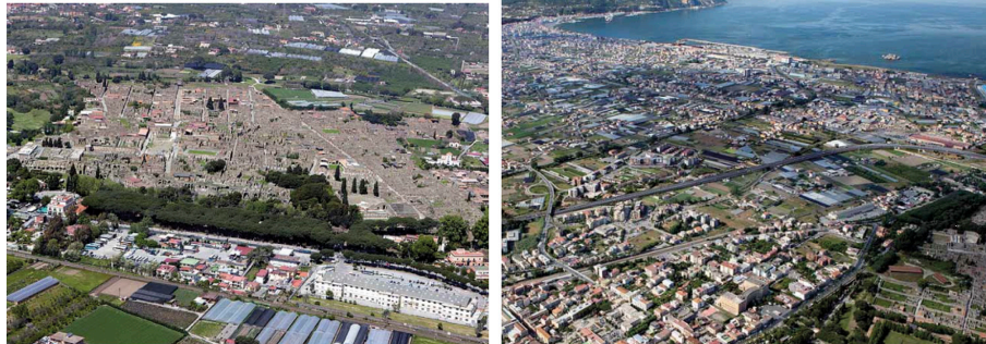
Figure 1: (a and b) Pompeii archaeological area and the sea.