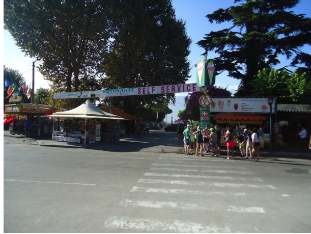
Figures 4–7: The first stretch of Via Plinio with street vendors.