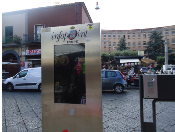
Figures 12–15: Via Plinio and Piazza Anfiteatro.