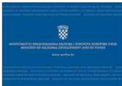
Ministry of Regional Development and EU Funds of the Republic of Croatia https://razvoj.gov.hr/