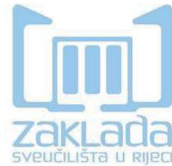
University of Rijeka Foundation http://iuri.uniri.hr/const_func/university-of-rijeka-foundation/