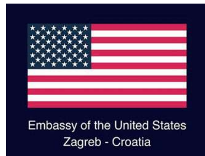
Embassy of the United States Zagreb - Croatia https://hr.usembassy.gov/