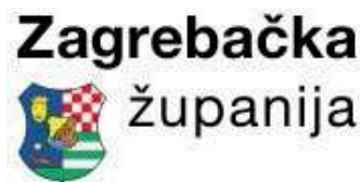
Zagreb County, Zagreb, Republic of Croatia https://www.zagrebacka-zupanija.hr/