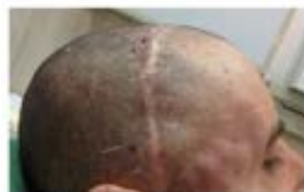
Figure 9. Immediate postoperative lateral right view result of the same patient shown in Figure 8.

According to the preoperative planning, the senior author injected deep to the bone, in order to improve volumetric deficiencies and to restore the eurhythmy of the temporoparietal shape. A total of 4 mL of HA filler was injected to each side during each injective session (Figure 9).