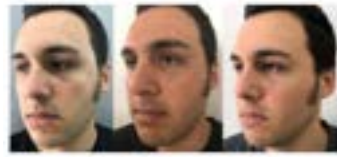
Figure 4. Preoperative, 2- and 12-months postoperative, three-quarter left view results of the same patient shown in Figure 2.