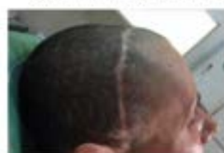
Figure 10. The 13-month postoperative lateral right view result of the same patient shown in Figure 8.

At the 13-month follow-up, we assessed the stability of the results (Figure 10).