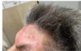
Figure 15. Aesthetical improvement in the forehead region after multiple HA injections: 9-month follow-up results of the same patient are shown in Figure 14.

The flap healed without any complications. Five repeated hyaluronic acid injections of a 20 mg/mL, 1,4-butanediol diglycidyl ether (BDDE) cross-linked HA filler (Hyamira Basic, Nyuma Pharma, Arona, Italy) were performed to reduce the concave aspect of the grafted site. HA injections were performed deep to the bone. A total of 0.2 mL of HA filler was injected during every injective session. The results remained stable at the 9-month follow-up (Figure 15).