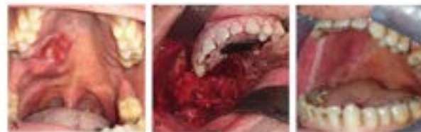
Figure 16. Hard palate carcinoma (A); intraoperative picture of tumor removal (B); reconstruction of intraoral defect (C).

A 55-year-old man presented to our Craniomaxillofacial Surgery Unit for hard palate carcinoma. Tumor resection and reconstructive surgery were performed (Figure 16).