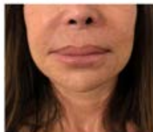
Figure 6. Frontal view of the same patient shown in Figure 5 at the 3-month follow-up of hyaluronic acid injections performed to restore lip competence.

Lip incompetence and lower teeth display at rest were secondary to an excessive resection of lower lip mucosa after lip implant removal performed by another surgeon. The patient was scheduled to have surgical repair of the defect, with the aim to achieve lip restoration. During preoperative evaluation, a solitary pulmonary nodule revealed lung cancer. For this reason, a cosmetic surgical approach could not be performed. Thus, a minimally invasive procedure was offered to temporarily improve her lip appearance. Hyaluronic acid injections were planned. Injections were performed with a 15 mg/mL, 1,4-butanediol diglycidyl ether (BDDE) cross-linked, HA filler (Teosyal PureSense Redensity II, Teoxane, Geneva, Switzerland). A total of 3 mL of HA filler was injected. HA perpendicular injections were performed through the skin, into the inner side of the lip, to obtain lip eversion, and to recruit tissues to cover the lower displayed teeth. No touch-up was required. At 3- and 6 month follow-ups, stable results were observed (Figures 6 and 7).