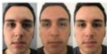
Figure 3. Preoperative, 2- and 12-months postoperative frontal view results of the same patient shown in Figure 2.

The patient was followed up for 1-year showing stable results (Figures 3 and 4).