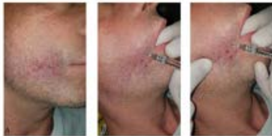
Figure 18. Preoperative planning, HA was injected in a grid-like fashion: preoperative planning (A). Biphasic injection with retrograde technique was performed; nine site injections were given (B,C).