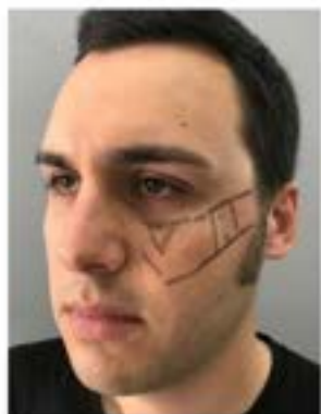
Figure 2. Preoperative marking of a patient presenting poor consolidated malar bone fracture.

We proposed both surgical and non-surgical approaches. In the surgical option, reduction and rigid fixation was suggested. The non-surgical option was based on HA filler injection to restore the proper projection of the injured side. The patient, clearly informed about the non-permanent effect of the procedure, opted for the non-surgical approach. After careful radiological evaluation, we injected 1 mL of VYC-20L, a 20-mg/mL, 1,4-butanediol diglycidyl ether (BDDE) cross-linked, HA gel (Juvèderm Voluma with Lidocaine, Allergan Inc., Irvine, CA, USA) deep to the bone, 0.2 mL in medial area, 0.4 mL in two points in the lateral area. We then injected 1 mL of VYC-17L, a 17.5 mg/mL, 1,4-butanediol diglycidyl ether (BDDE) cross-linked, HA filler (Juvèderm Volift with Lidocaine, Allergan Inc., Irvine, CA, USA) in the subcutaneous layer with cannula, with the aim to restore malar projection (Figure 2).