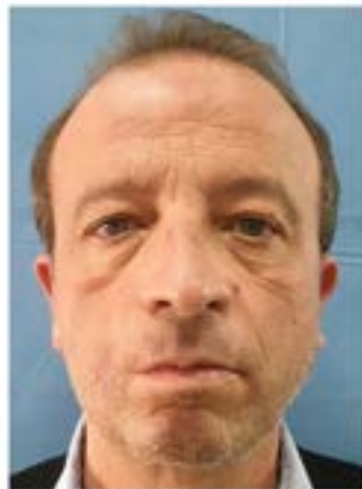
Figure 19. Aesthetical improvement in the right cheek region: 8-month follow-up result of the same patient shown in Figure 17.

Patient and HA filler reconstructive procedure data are summarized in Table 1.