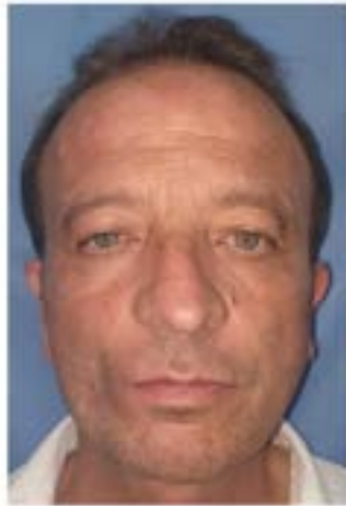
Figure 17. Donor site morbidity: anesthetic notching in right cheek region.