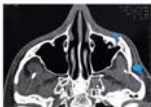
Figure 1. CT imaging of the left displaced malar fracture. Blue dots describe HA injection deep to the bone.

and the patient noted facial asymmetry; thus, he underwent a computed tomography (CT) evaluation. TC results showed a complete fracture of the zygomatic arch.. After several surgical counseling sessions, the patient arrived at our department 9 months after trauma. Clinical assessment was performed, with the aim to exclude functional disorders, such as reduction in mouth opening. A diagnosis of a poor consolidated malar bone fracture was confirmed at the CT scan examination (Figure 1).