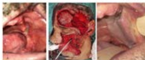
Figure 13. Maxillary malignant tumor (A); intraoperative picture of flap harvesting (B); reconstruction of intraoral defect (C).

A 74-old-man was referred to the Department of Craniomaxillofacial Surgery at the University of Campania “Luigi Vanvitelli”, Naples, for evaluation of a maxillary malignant tumor. After tumor resection, facial reconstructive surgery was performed. Superficial temporal artery perforator (STAP) flap was harvested for the restoration of intraoral defect (Figure 13) and the donor site was contextually skin grafted (Figure 14).