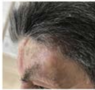
Figure 14. Split thickness skin graft in forehead region.

The flap healed without any complications. Five repeated hyaluronic acid injections of a 20 mg/mL, 1,4-butanediol diglycidyl ether (BDDE) cross-linked HA filler (Hyamira Basic, Nyuma Pharma, Arona, Italy) were performed to reduce the concave aspect of the grafted site. HA injections were performed deep to the bone. A total of 0.2 mL of HA filler was injected during every injective session. The results remained stable at the 9-month follow-up (Figure 15).