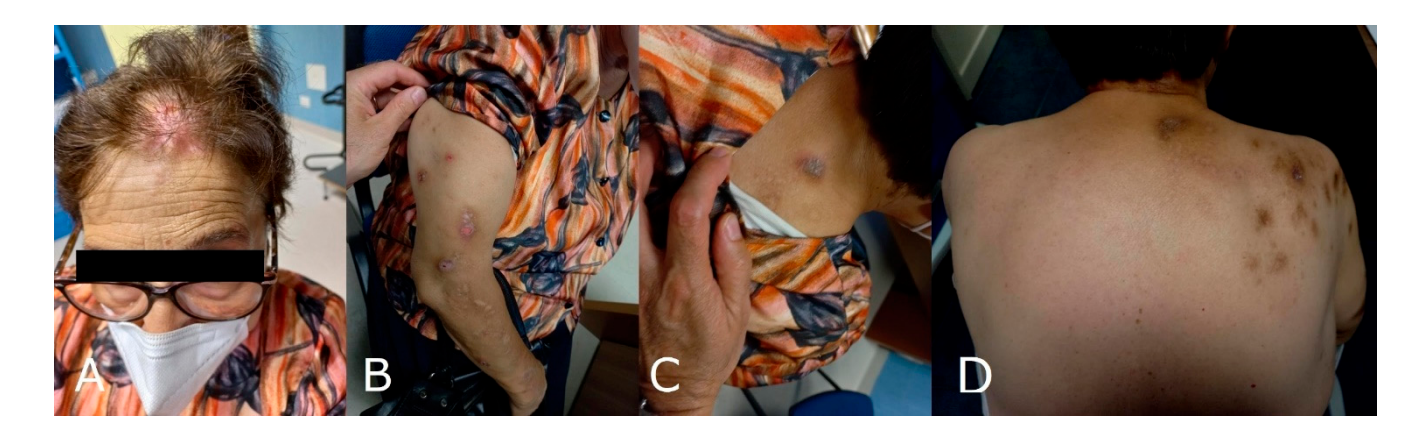
Figure 2. Multiple hyperkeratotic nodules on the right side of the head ( A ), the right upper limb ( B ), and the right upper trunk ( C , D ) before dupilumab treatment.