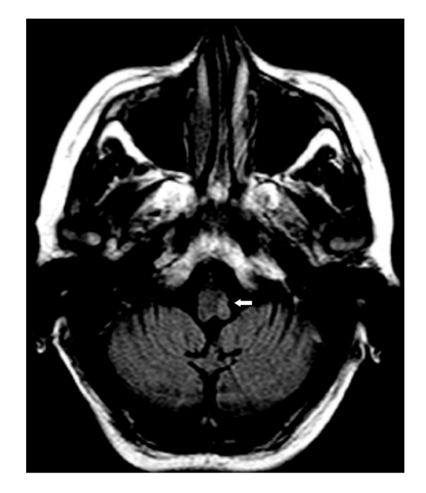
Figure 1. An axial FLAIR-weighted MRI image showing a hyperintense area (white arrow) in the left lateral medulla, suggestive of infarct.