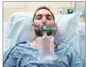
Figure 3. Nonbreather and Partial Nonbreather Face Masks.

The simple face mask does not have a reservoir. The fraction of inspired oxygen is determined by the oxygen flow rate, the fit of the mask, and the patient's minute ventilation.