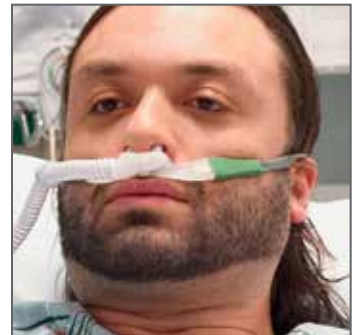
Figure 4. High-Flow Nasal Cannula.

The use of high-flow nasal cannulas was initially avoided in patients with Covid-19, because the cannulas were thought to be associated with an increased risk of aerosolization and airborne transmission of the pathogen. However, emerging data suggest that this device can be used in patients with less severe forms of