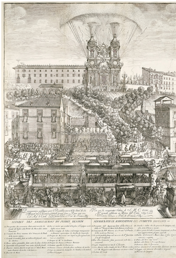
Fig. 4 Vincenzo Mariotti (1675–1738), Fireworks Display at Trinità dei Monti on 20 April, 1687, for the Recovery of Louis XIV of France from an Illness, with Simone Felice Delino's Ephemeral Decoration of the Façade of the Church . Engraving, 80.4 x 55.3 cm. Galerie Tarantino, Paris.

appearance of the church's central door, alluding to a triumphal arch scheme. The upper part of the façade, by contrast, ends in a mixtilinear pediment with a triangular tympanum with inflected sides, inside which is a radiate glory – an obvious allusion to the “splendour” of Bernini's Throne of St Peter – where between a crown-cartouche and an eagle, we see the image of the Holy