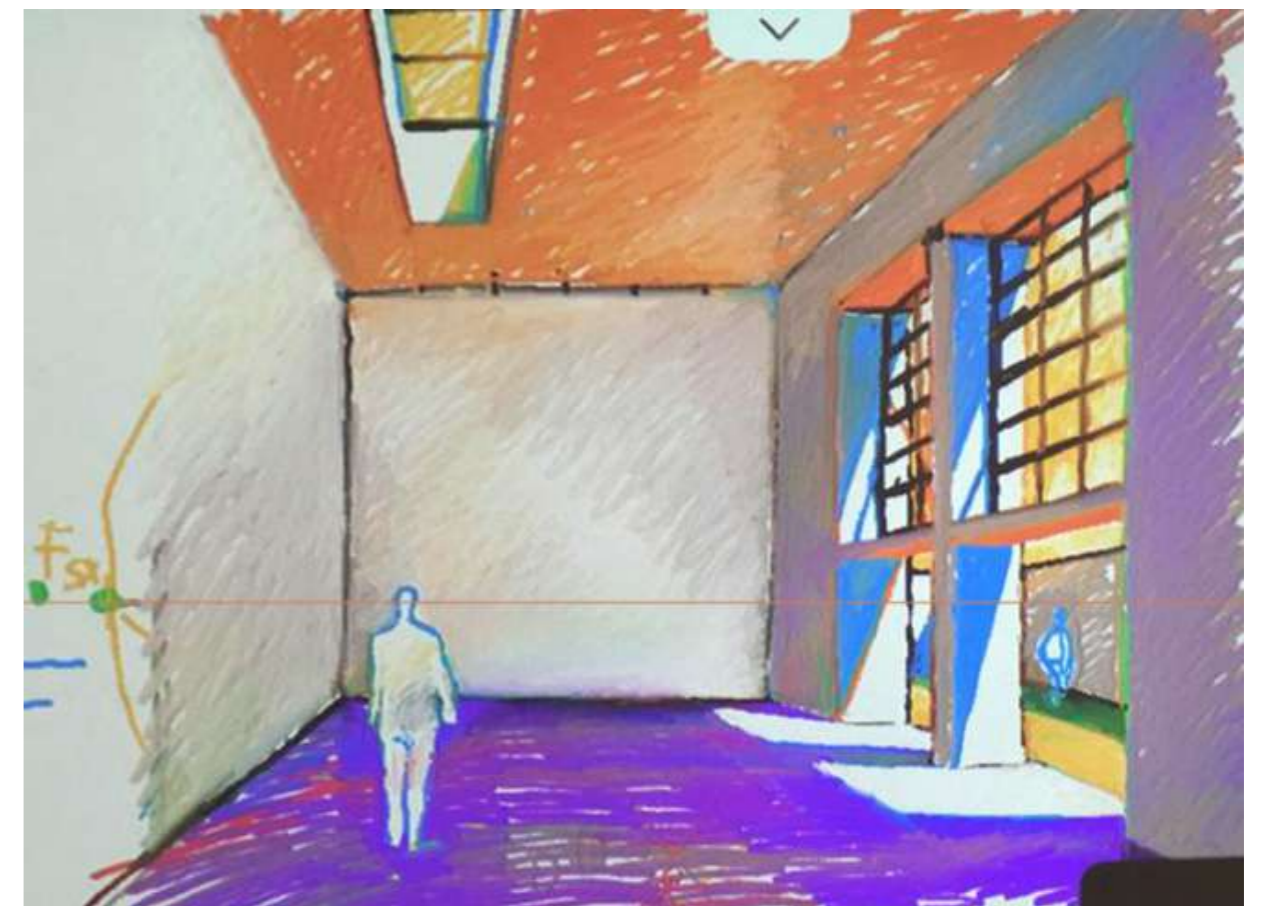
Fig.04 Sketching an interior perspective view on the digital tablet (Digital painting)

The students apparently reacted with an increasing and active presence to the course. While at the beginning only six or seven of them came to faculty, at the end of November, 28 of them, almost half of registered students, were present in the classroom. Despite the scheduled turns, some students asked to be invited almost always while a few of them, generally living outside Rome, preferred to stay home for the whole course.