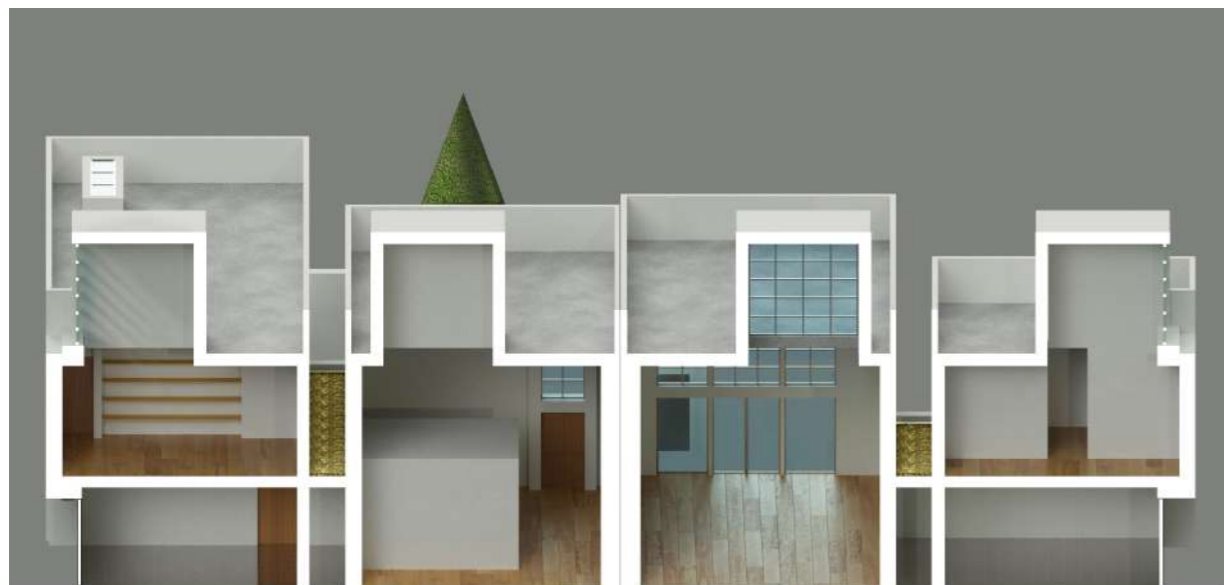
Fig.03 Leonardo Perna, Rendering from the digital model (Autocad)

adopted. The collegial correction, albeit anonymous, of the exercises is one of these expedients to let knowledge circulate. Another one is the public presentation of Gehry's works. In drawing a sheet of free-hand sketches, students were suggested to think of particular subjects (a pizza-boy, a night thief, a little bird, and so on) and routes in the house, introducing a sort of "role-play game" narration able to engage their imagination and enthusiasm. In some cases, small study groups spontaneously formed and worked home albeit keeping the social distance, but students were also encouraged to share their homework time through apps, such as Discord, that allow them to chat, share images and videos, and listen to music together while drawing. In this sense, the course was promoted as a non-competitive work environment but rather open to error, experimentation, and sharing, as university should always be. In the case of drawing and designing disciplines, social distancing discourages a direct emulation of the teacher, who is not allowed to be sitting down near the students and drawing together with them, on their own sheets. To struggle this situation, the use