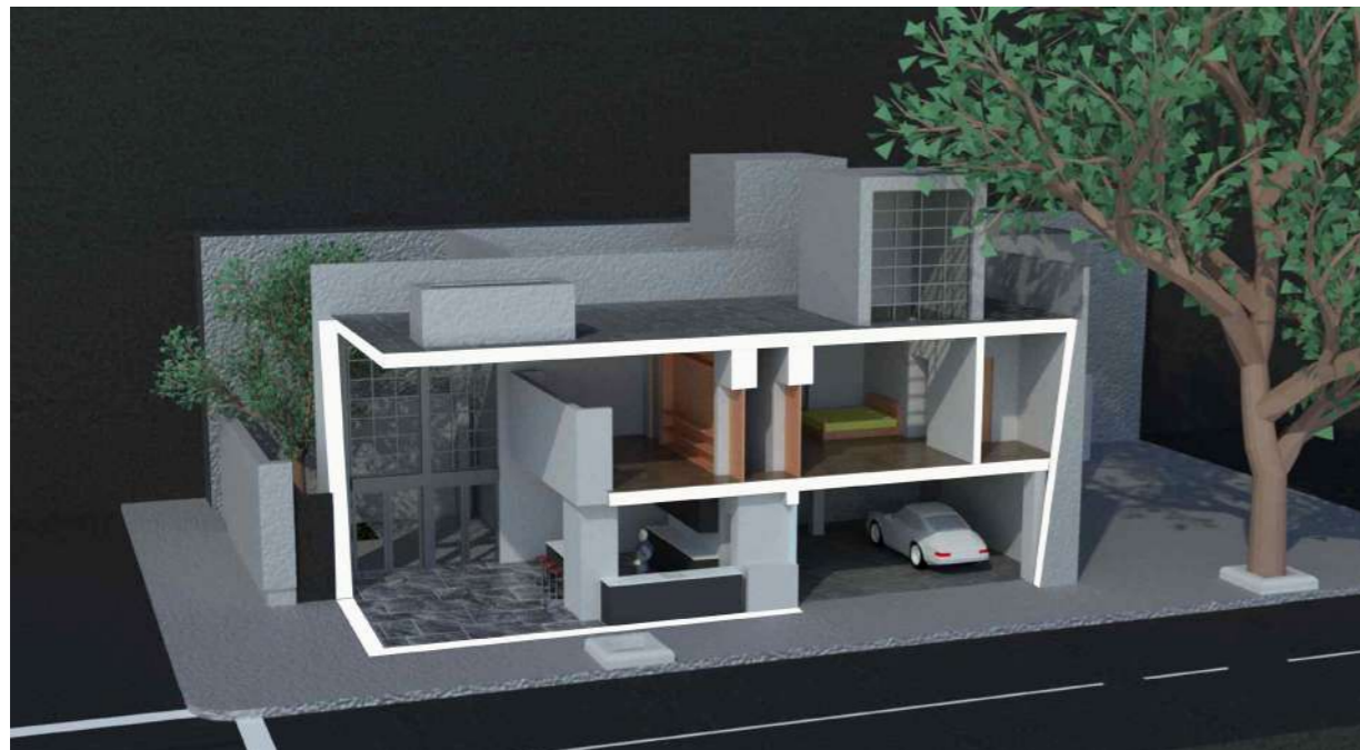
Fig.02 Renato Danilo Carcione, Rendering from the digital model (Autocad)

organize themselves in small groups, to develop a mutual support, to share data and tricks, to emulate the good-practices, and to grow their own self-confidence. The maturation of the so-called 'soft skills' is accompanied by a series of behaviors that quickly transform a series of individuals into a class endowed with a sort of collective intelligence. Teaching in the socially distanced classroom, with half or more students attending from home, also has the contraindication of discouraging these behaviors and keeping the relationship between teacher and student on an individual level. To overcome this limitation, in addition to the institutional platforms, such as Sapienza E-learning, some expedients were