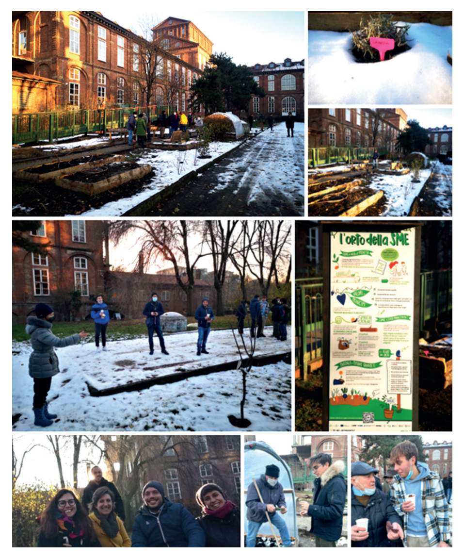
Fig. 4 – Inaugural event of the container garden

On December 17, we finally inaugurated 'L'orto della SME', with an event attended by over 50 stakeholders actively involved in the garden. Symbolically, seeds were planted at the end of the event, in what has now become a fully harvesting garden that offers, among others, potatoes, sage, borage, spinach and flowers (Fig. 4).