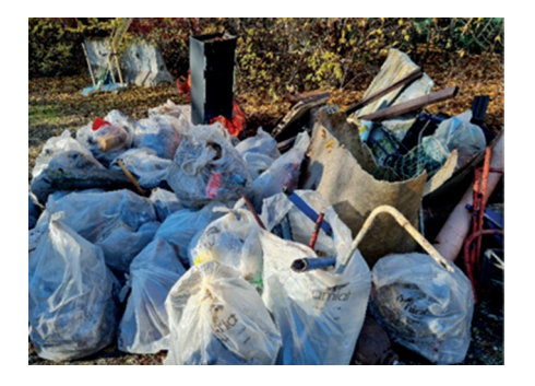
Fig. 3 - CleanUp the SME event

Another milestone towards the opening of our garden, was the "CleanUp the SME" event, held on November 26. Helped by the university citizenry and Amiat Gruppo Iren (Local multi-utility), we cleaned up 860kgs of waste (Fig. 3).