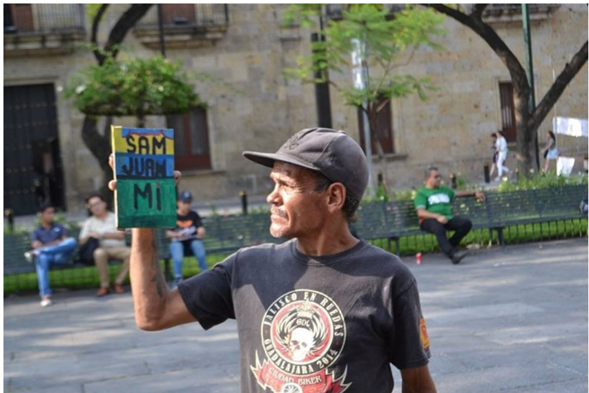
Figure 3. A participant in the cartonera workshop in Guadalajara’s Liberation Square holds aloft his book. [This figure appears in color in the online issue.]