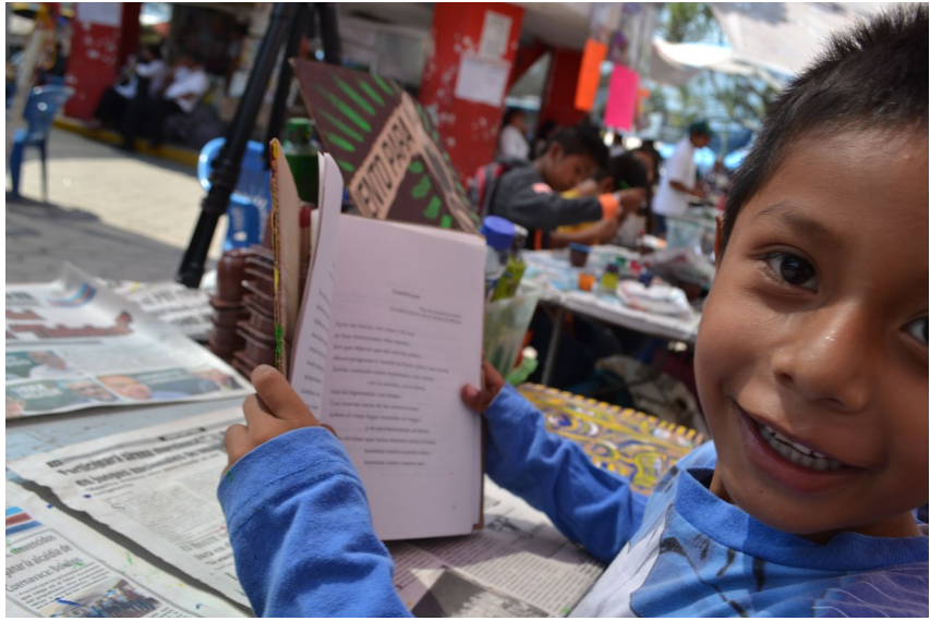
Figure 1. A boy holds up his cardboard book in Xoxocotla. [This figure appears in color in the online issue.]

festival celebrating Mexico's "mother tongues." Xoxocotla, with its large Indigenous population and history of resistance, has hosted the festival for the last decade. In 1989, villagers disputed the results of a local election, alleging electoral fraud, and in the ensuing protests several demonstrators were killed by security forces. Then, in the 2000s, residents successfully campaigned against a new airport that would have evicted local farmers from their lands. The book-making workshop is an important chapter in this story of struggle, with children collating a Spanish-Nahuatl edition of stories, poems, and recipes. As night falls and we pack up, the crowd grows and residents join us for a carnival of participative democracy, an event where village leaders explain and discuss imminent changes to local municipal voting wards. A statue of Emiliano Zapata looks down approvingly.