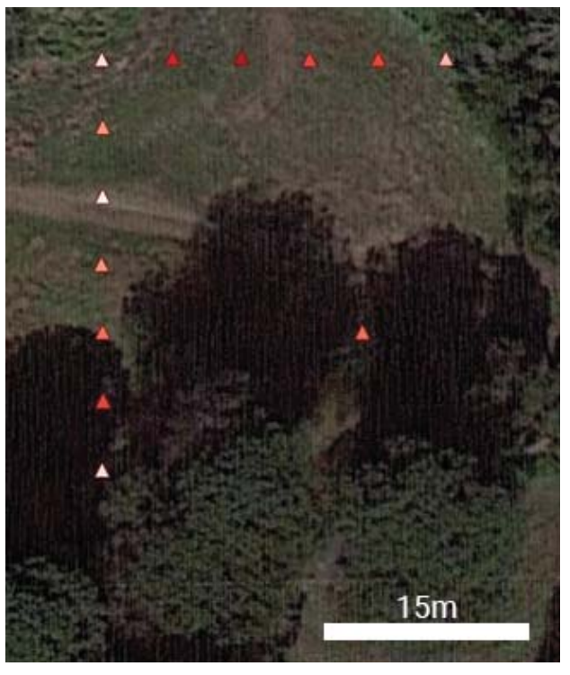
Figure 5. Absolute deviations of coordinates measured with handheld receiver from integer coordinates of nodes

The advantages of this approach are mainly two: the geometric correctness of the grid itself in terms of shape and size, and its repeatability. As far as the first aspect is concerned, it is easy to see that points surveyed with receivers that have potentially centimetric accuracies on an absolute grid (such as the UTM grid) will make it possible to obtain a final grid with a much more regular and reliable geometry, making the results statistically much more significant. Furthermore, the possibility of being able to replicate the same grid with no margin of error even years later is of considerable interest. Once again, this allows for greater reliability and significance of the data but also makes it possible to finish and resume the research work without uncertainty even after days or in subsequent campaigns, even years apart.