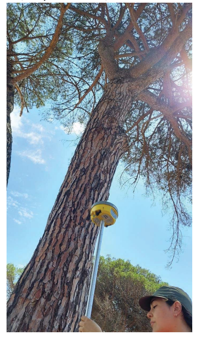
Figure 4. The survey with the Geomax receiver where the tree cover issue is evident

stations operated by the Lazio Region administration, the flat morphology, but also to the large number of observable satellites. Their layout (still fig. 5) suggests that both the physiological lower accuracy of the points identified with the metric tape and the obstructions of the trees, mainly those to the south, have an influence.