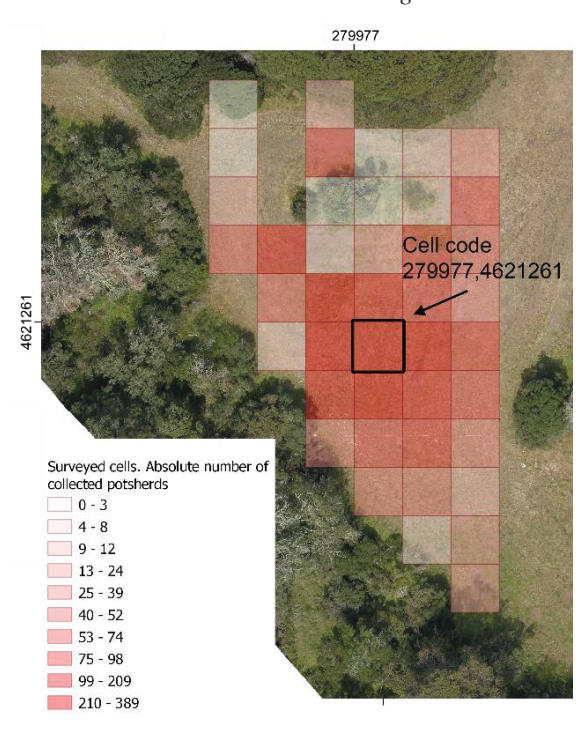
Figure 3. Cell code assignment procedure

To verify the potential of our approach and the limits of the Ardusimple receiver we compared it with a GNSS Geomax Zenith 10 receiver that acquires data from GPS and Glonass constellations in dual frequency by repeating a significant number of nodes of the grid (Fig. 4 and 5).