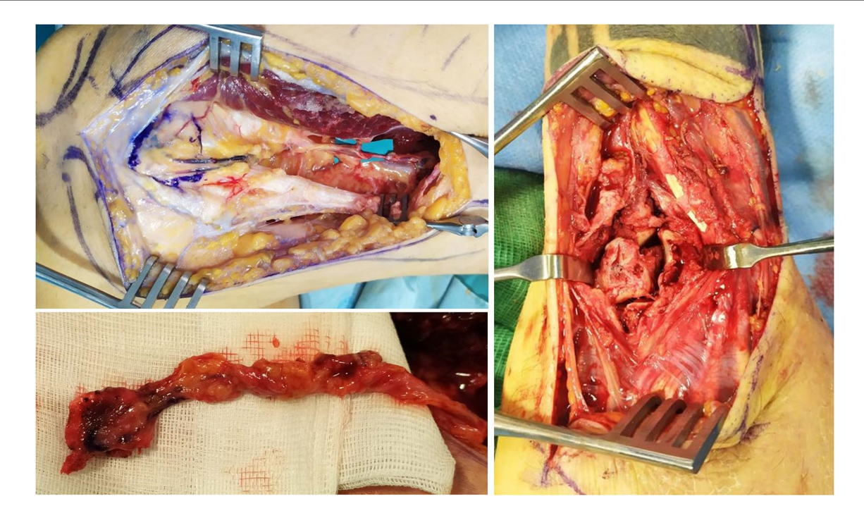
Fig. 2 Descending Genicular Artery is exposed and dissected back to its origin. On the left, the entrance of the pedicle into the flap and the harvested Medial Femoral Condyle corticocancellous flap. On the right, inset of the flap through the dorsal incision

perform accurate haemostasis, the donor site was closed in layers with absorbable suture and a drain was placed in the thigh.