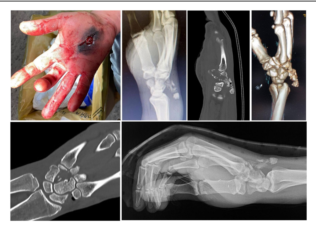
Fig. 1 Penetrating injury of the right hand. X-ray scan and TC showed hamate bone comminute fracture and dislocation in the subcutaneous plane. After the first procedure in which debridement and nervous and tendinous reconstruction was performed, a plaster cast was applied

The patient underwent to a first operation in which debridement and exploration with a volar approach were performed. Rupture of the 4th and 5th finger deep (DDFT) and superficial (SDFT) digital flexor tendons was revealed and repaired by a 4-strand 3–0 suture of the DDFT. Additionally, a discontinuity of the motor branch of the ulnar nerve was detected and repaired following Guyon's canal release. Bone fixation was not performed due to the high risk of infection. At the end of the operation, the hand was immobilized by a plaster cast (PIPJ at 120° and MFJ at 45°).