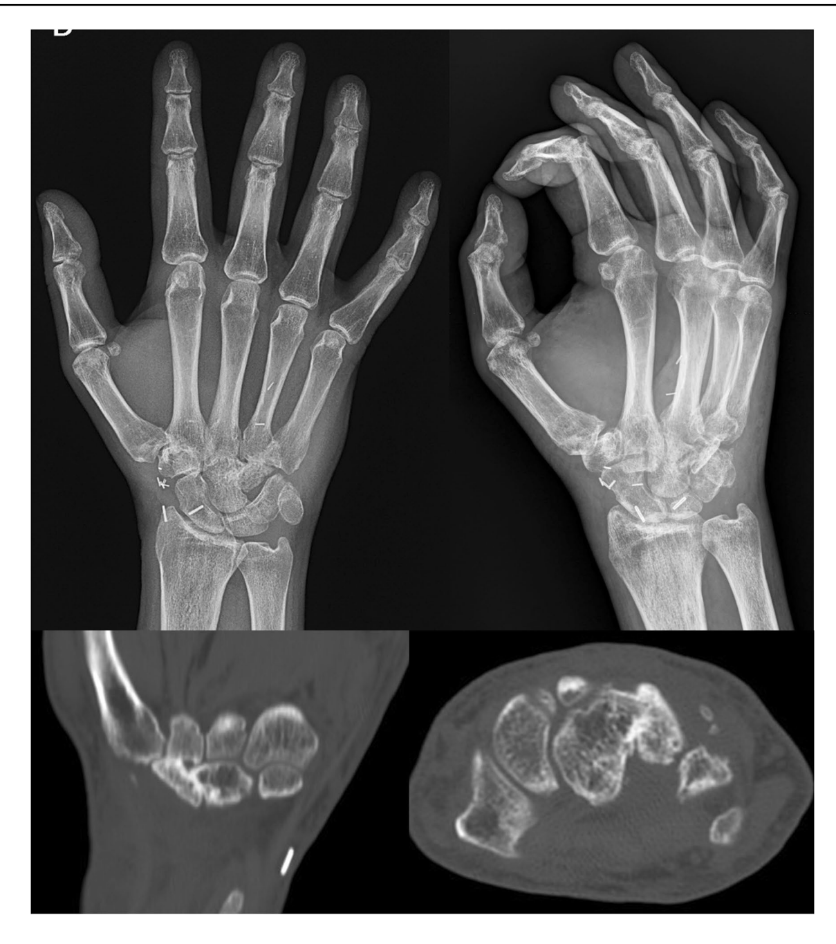
Fig. 3 X-ray and CT scan, 16 weeks and 6 months postoperatively. Flap viability and ulnar carpal-metacarpal joint stability are evaluated