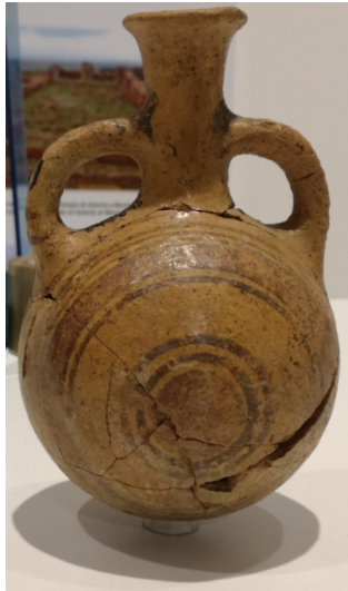
Figure 2: The Cipriot-Phoenician globular jug (IX-VIII century B.C.) used to test the 3D modelling capabilities of the Structure Sensor.

Phoenician globular jug (IX-VIII century B.C.) captured by this low-cost range camera was compared to the 3D model of the same object obtained with the photogrammetric technique. The jug, characterized by a rather shiny surface and the presence of several breaks (see Figure 2), is conserved at the Museum of the Near East, Egypt and Mediterranean of the University of Rome “La Sapienza” (Nigro, 2015) directed by Prof. L. Nigro.