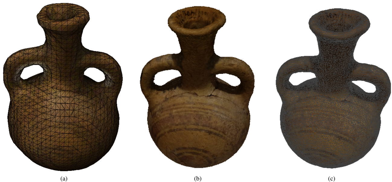
Figure 5: The generated 3D models: (a) solid wireframe visualization of the Structure Sensor model; (b) solid visualization of the high resolution photogrammetric model; (c) solid wireframe visualization of the medium resolution photogrammetric model.

deed, the colouring approach used by the Scanner app of Occipital seems to smooth the texture details; occasionally the colour is not perfectly aligned to the 3D geometry in some areas of the model, in particular for those captured at end of the scanning process (at the end of the 360° path). This behaviour can be explained with a not perfect outcome of the calibration, residual tracking errors and/or motion blur effects occurred when capturing key frames.