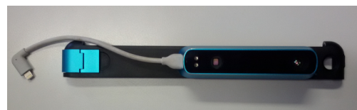
Figure 1: The Structure Sensor by Occipital.

systematically these devices on the field, it is essential to assess the metric quality of their 3D geometry reconstruction. This work investigates precisely the 3D modelling capabilities of a promising low-cost range camera, the Structure Sensor™ by Occipital (Figure 1).