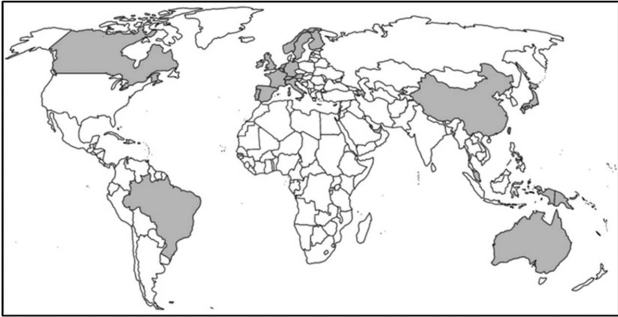
Fig. 3. Current use of universal leukoreduction.

recently showed that, in rabbits, HTLV-2 has a lower infection and replication efficiency in comparison to HTLV-1. Experimental HTLV-1 infection, without disease development, in nonhuman primates was demonstrated in several monkey species inoculated with autologous ( 1 \times 10^8 ) 92,93 or homologous ( 1 \times 10^7 ) 93 infected cells. More recently, development of clinical disease was reported in pig-tailed macaques after inoculation with 5 \times 10^6 to 10 \times 10^6 mangabey cells infected with an HTLV-1 molecular clone. 94