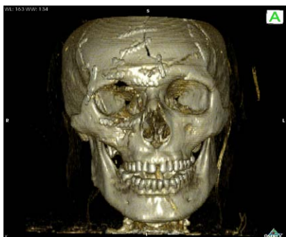
Figure 3: A 3D CT reconstruction in submental view showing the frontal fracture.

and the superior longitudinal sinus was clipped without difficulty. A large-scale duroplasty was performed with a bovine pericardial patch. Fibrin sealant was applied over the repair. The mucosa was removed from the frontal sinus walls as well as from the nasofrontal ducts. The pericranial flap is adapted in order to fit the anterior cranial fossa. The frontal volet was then replaced and secured with plates and screws. It's imperative to relieve any sharp bony edges off the anterior aspect of the bone flap to prevent injury to the vascular pedicle of the pericranial flap. After cranialization, the nasofrontal ducts was obliterated with a piece of temporalis fascia, fibrin glue is applied over the ducts, and the pericranial flap is designed appropriately and folded in order to obliterate the dead space of the sinus. The anterior wall was replaced and secured using plates and screws. All bony impingements on the vascular supply of the flap must be relieved. The bi-temporal flap was then closed in a layered fashion and a pressure dressing is applied and maintained for 48 h [2,3].