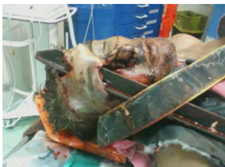
Figure 1: The Patient arrived in ER dept. with the rod passing through frontal area entering in the superior eyelid pushing the eye globe.