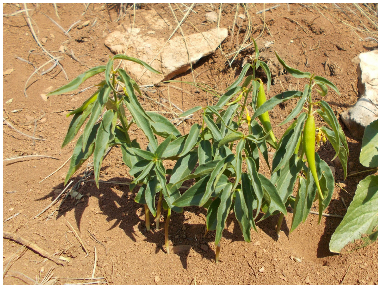
Fig. 1. Vincetoxicum mugodsharicum – Russia, Samara province, Pohvistnevo district, mountain Kopeika, 5 Jun 2014, photograph by A. V. Ivanova.

and P. prostratum have to be excluded from Polycarpon , while the remaining members represent a polyploid complex. Kool & al. (2007) also suggested to treat all the members of the P. tetraphyllum (L.) L. group as a single species with several infraspecific taxa. Accordingly, new nomenclatural combinations were proposed also considering morphological, ecological, and chorological data (see, e.g., Iamonico 2013, 2015; Iamonico & Domina 2015).