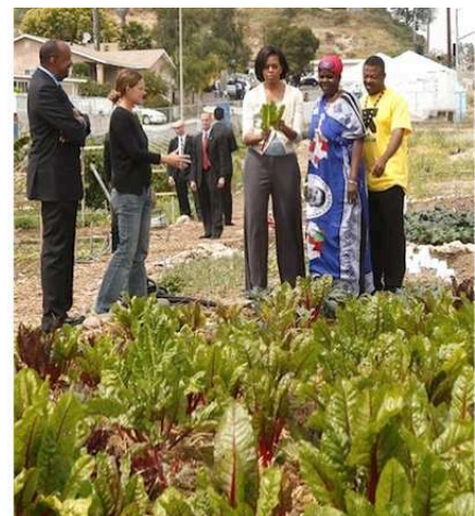
Fig. 3. - 4. Refugees working in the community garden (left) and First Lady Michelle Obama, visiting 'New Roots Community Farm', San Diego, April 15, 2010.