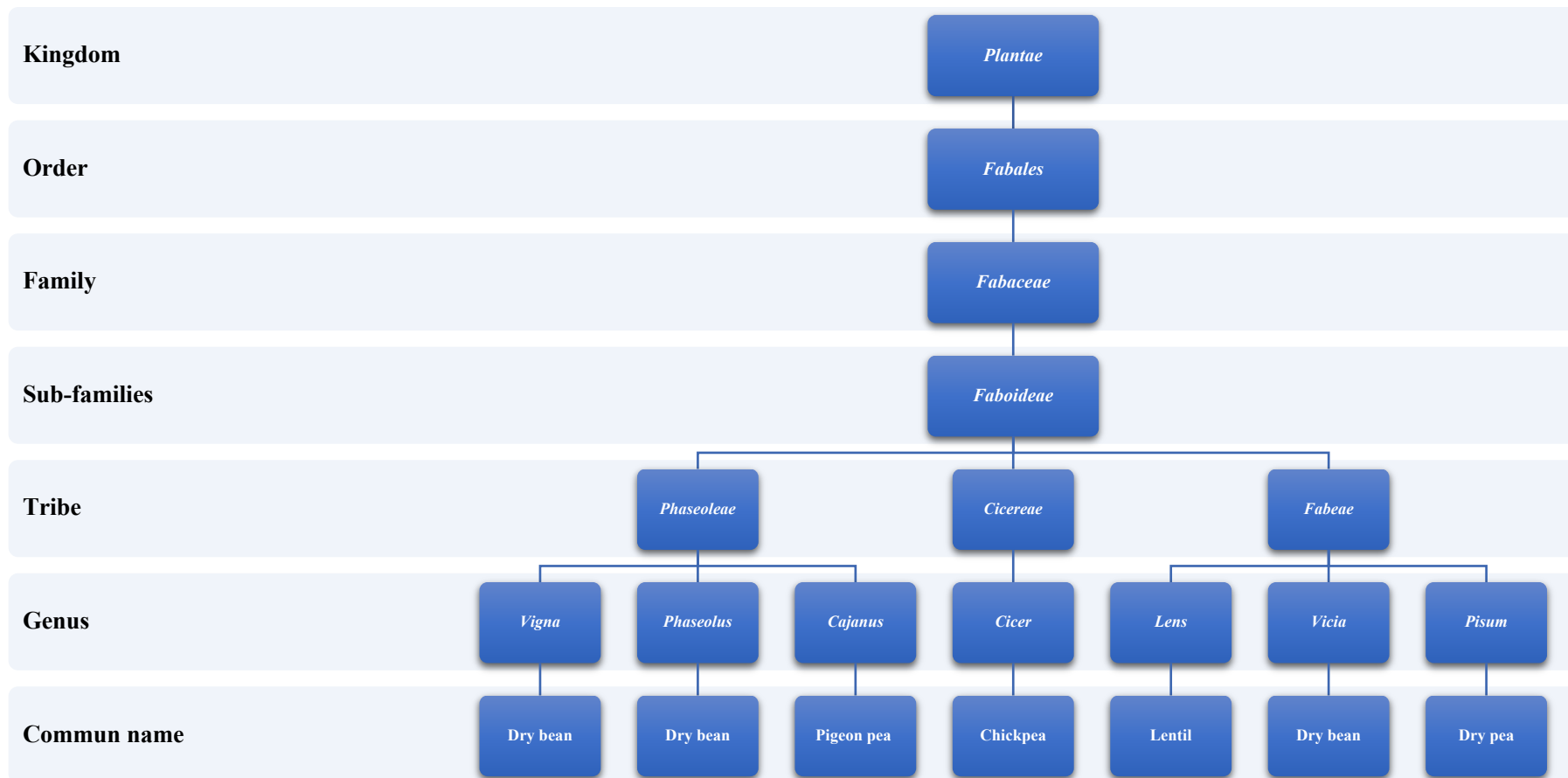
Figure 1: Classification and botanical description of pulses.