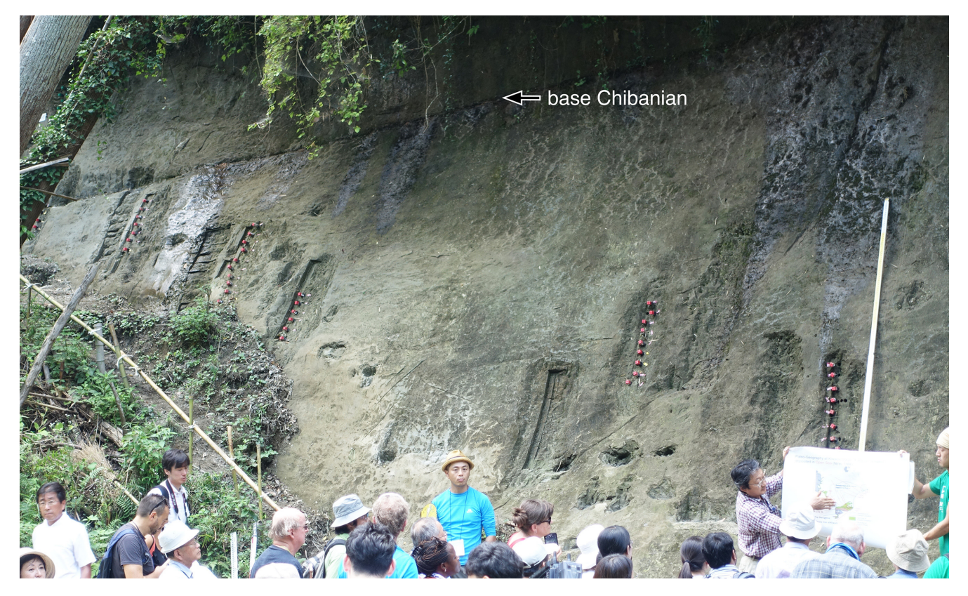
Figure 3. Chiba section, Japan: site of the GSSP for the now ratified Chibanian Stage and Middle Pleistocene Subseries. The marker bed for the GSSP is the Ontake-Byakubi-E (Byk-E) tephra bed (indicated by an arrow) which is 1.1 m below the directional midpoint of the Matuyama–Brunhes paleomagnetic boundary. This reversal serves as the primary guide to the Lower–Middle Pleistocene boundary, allowing its global recognition. Photograph by MJH taken at the INQUA Post-Congress field trip, August 2015.