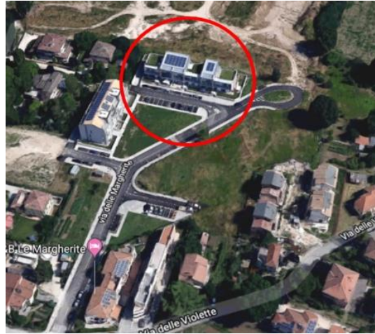
11 12 13 14 15 16 17 18 19 20 21 22 23 24 25 26 27 28 Figure 1. Bird view of the studied building.

2 3 4 5 6 7 Recante Norme per La Progettazione, l'installazione, l'esercizio e La Manutenzione Degli Impianti Termici Degli 8 Edifici Ai Fini Del Contenimento Dei Consumi Di Energia, in Attuazione Dell'art. 4, Comma 4, Della Legge 9 9 Genna, 1993), in the Umbria region, Italy. 10