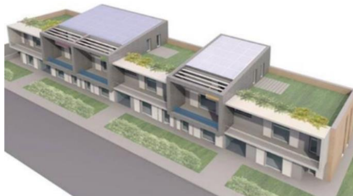
37 38 39 40 41 42 43 44 45 46 47 48 49 50 Figure 2. Rendering of the studied building.

29 30 The studied building is divided into twelve apartments; it is characterized by a compact shape with balconies 31 aligned along the south facade and a flat roof, except for the area occupied by the duplex apartments (Fig. 2). 32 Moreover, it is divided into an underground level and three levels above ground. The ground floor is employed as 33 private garages and technical rooms, while the other parts of the building are for residential use only. There are six 34 apartments on the ground floor and six on the first floor, with surfaces ranging from 71 m 2 to 95 m 2 . The roof 35 garden is properly insulated, and the duplex roof was designed to hold solar thermal and photovoltaic collectors. 36